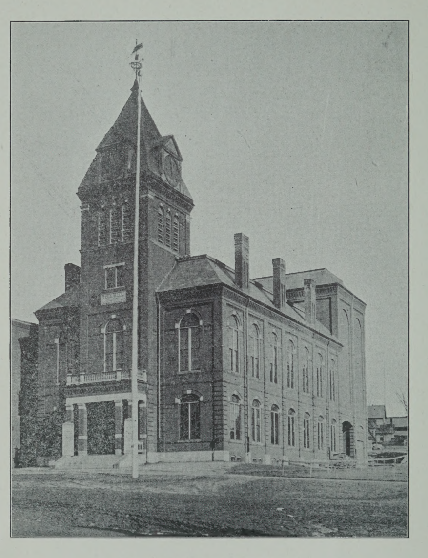
SULLIVAN COUNTY COURT HOUSE