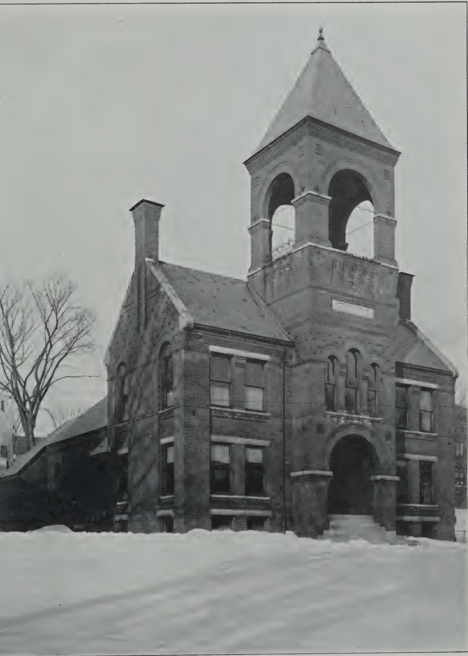
GRAFTON COUNTY COURT HOUSE, PLYMOUTH, N. H.