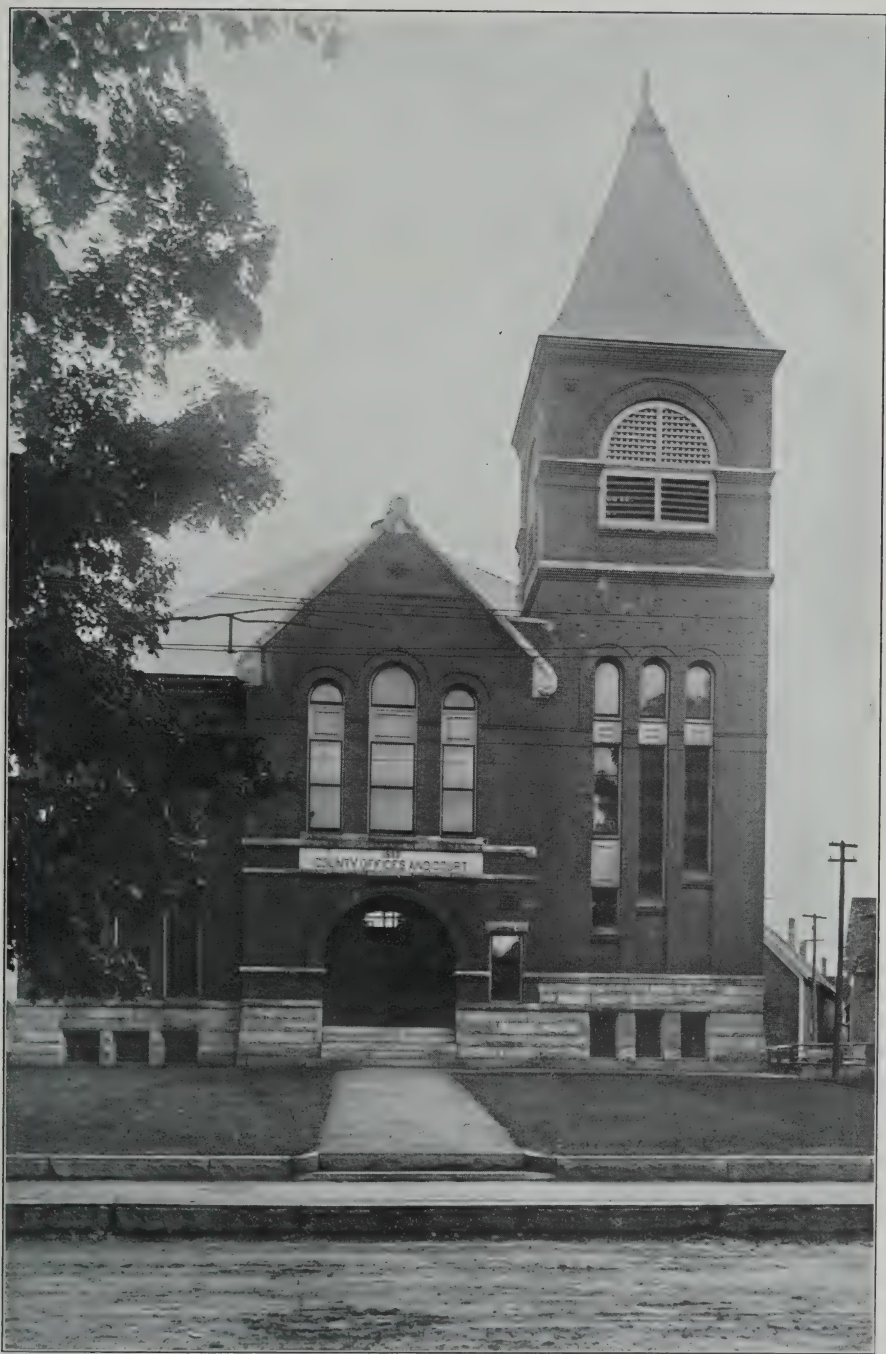
GRAFTON COUNTY COURT HOUSE, WOODSVILLE, N. H.