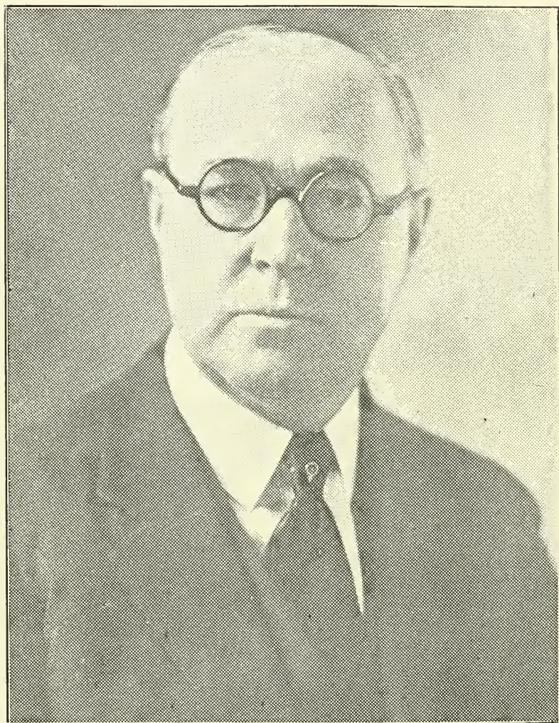
HON. JOSEPH A. VAILLANCOURT, MAYOR