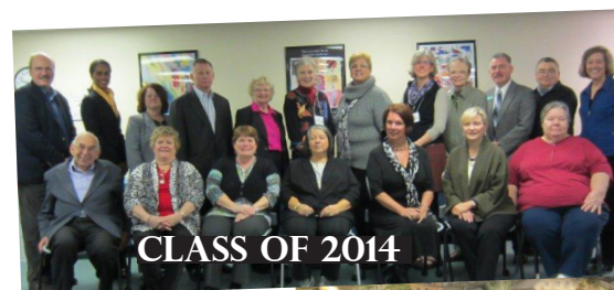
CLASS OF 2014

"I feel very fortunate that this opportunity found me (through an email offer from AARP), as it was a very enriching experience. Through what I learned in the workshops, I have been able to focus my goals on what is attainable rather than wasting my energy on worrying about goals that aren't. I think this is what gave me the greatest value...I learned that there are many opportunities for me to impact my community that are within the scope of my capabilities." - Senior Leadership Participant