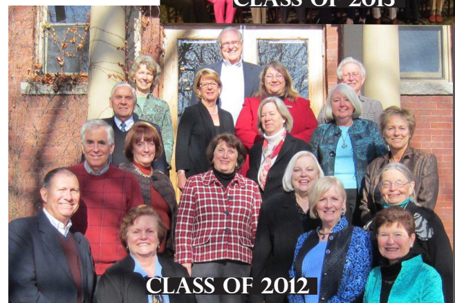
CLASS OF 2012