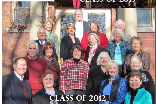
CLASS OF 2012