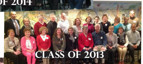
CLASS OF 2013