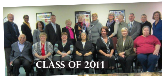
CLASS OF 2014

“I feel very fortunate that this opportunity found me (through an email offer from AARP), as it was a very enriching experience. Through what I learned in the workshops, I have been able to focus my goals on what is attainable rather than wasting my energy on worrying about goals that aren’t. I think this is what gave me the greatest value...I learned that there are many opportunities for me to impact my community that are within the scope of my capabilities.” - Senior Leadership Participant