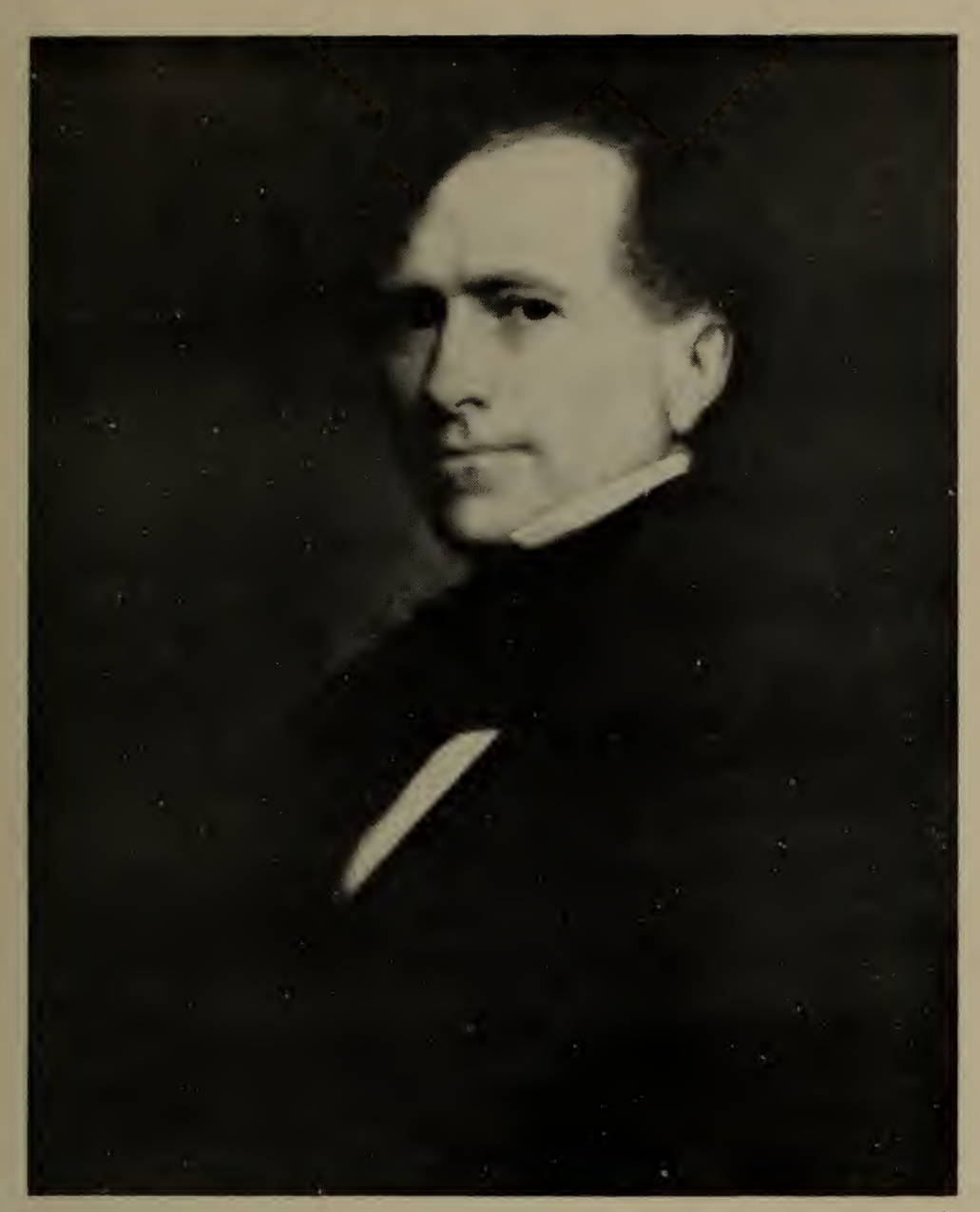
George P. A. Healy

Franklin Pierce National Gallery of Art, Washington, D. C. (Mellon Collection)