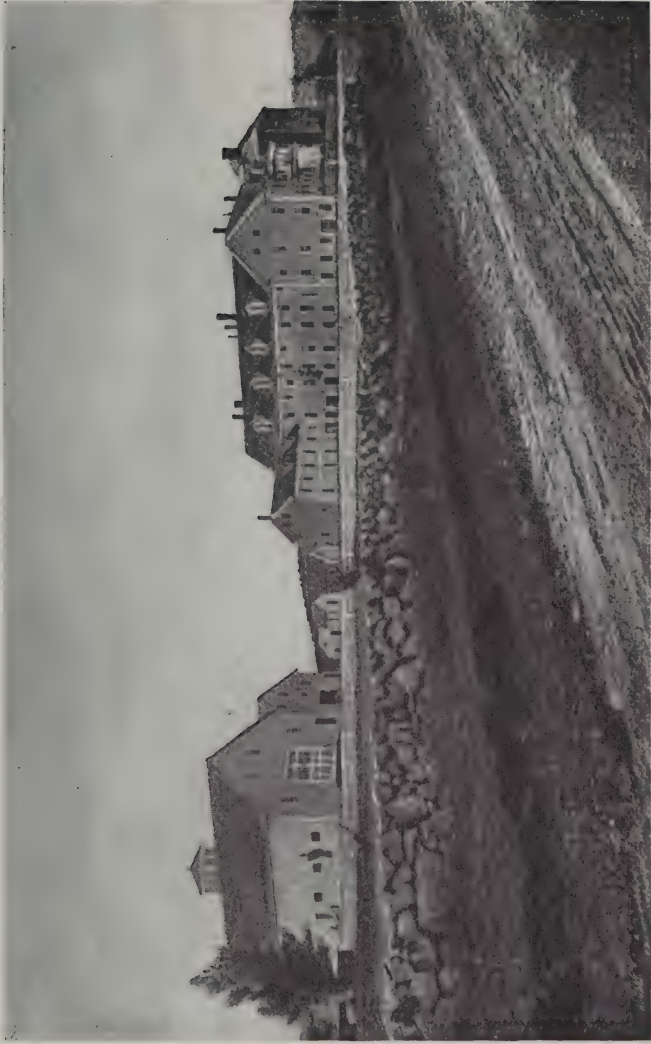
General View Carroll County Buildings at Ossipee