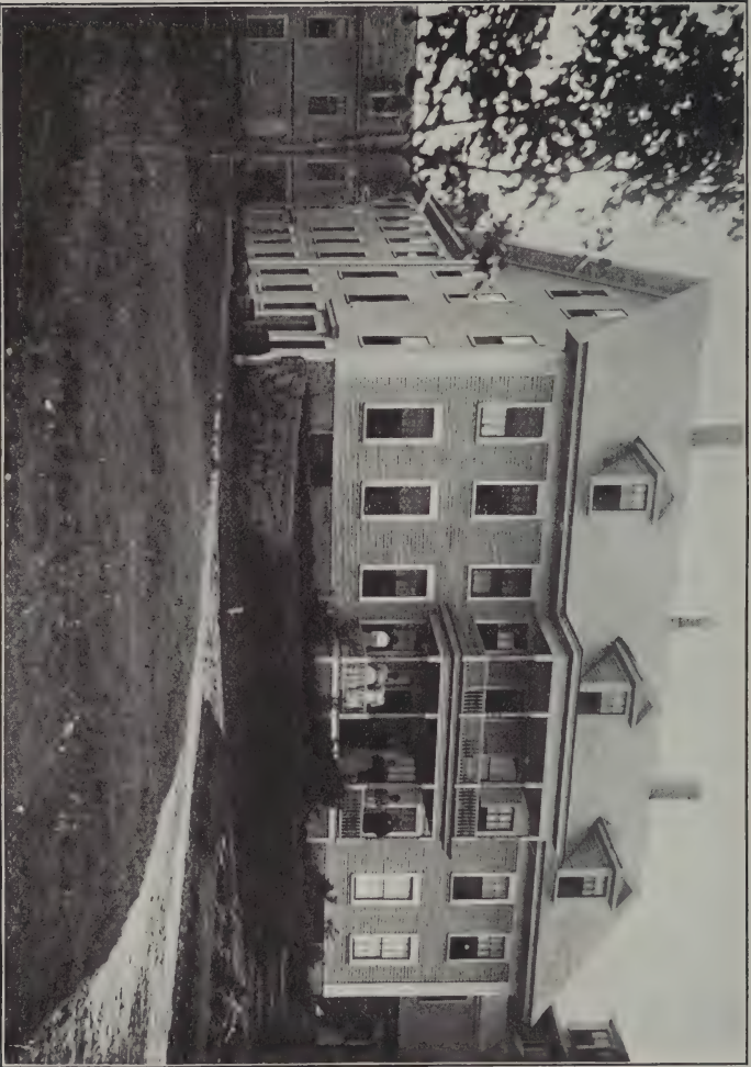
Carroll County Farm House at Osipee