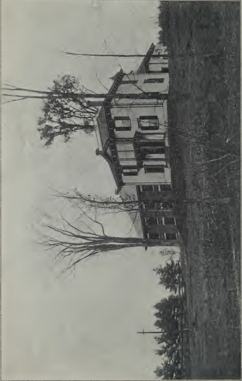
SULLIVAN COUNTY JAIL AND RESIDENCE.