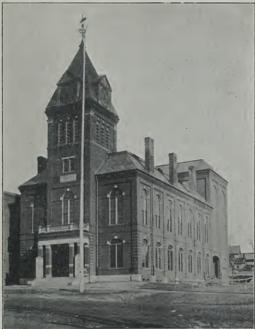
SULLIVAN COUNTY COURT HOUSE.