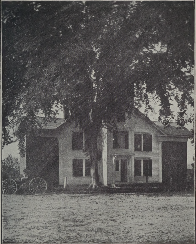
Carroll County Court House at Ossipee