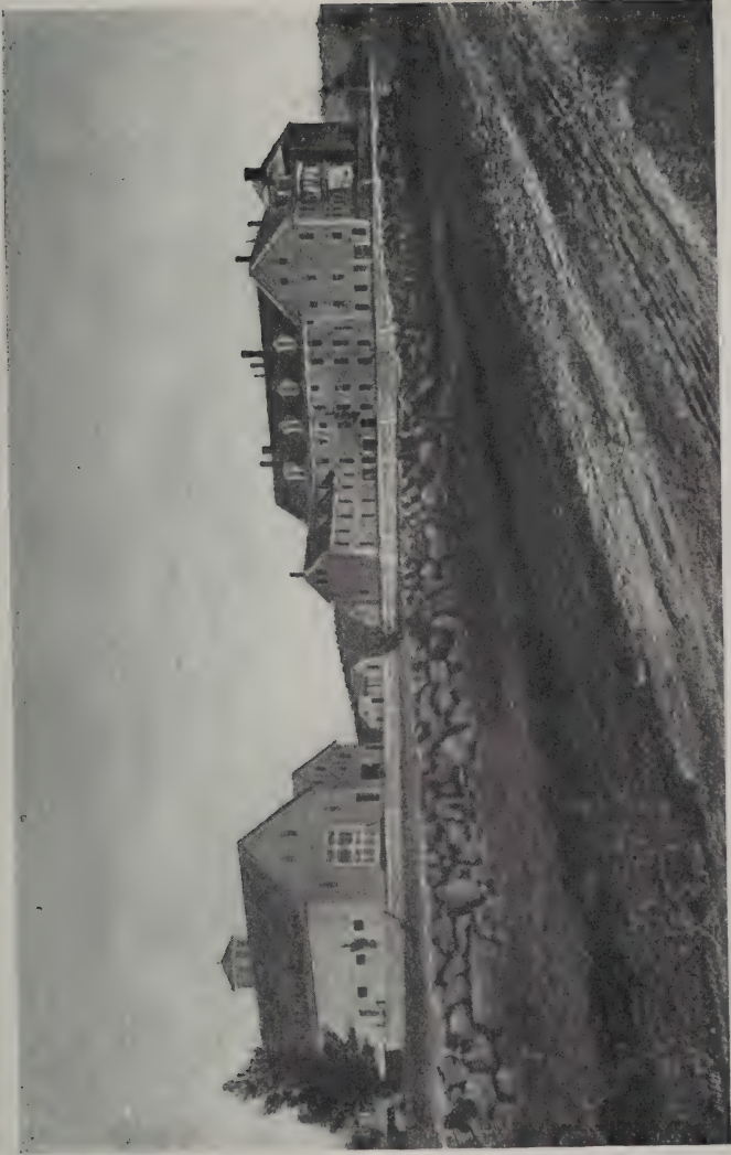
General View of Carroll County Buildings at Ossipee