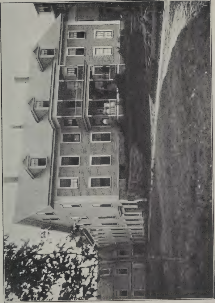
Carroll County Farm House at Ossipee