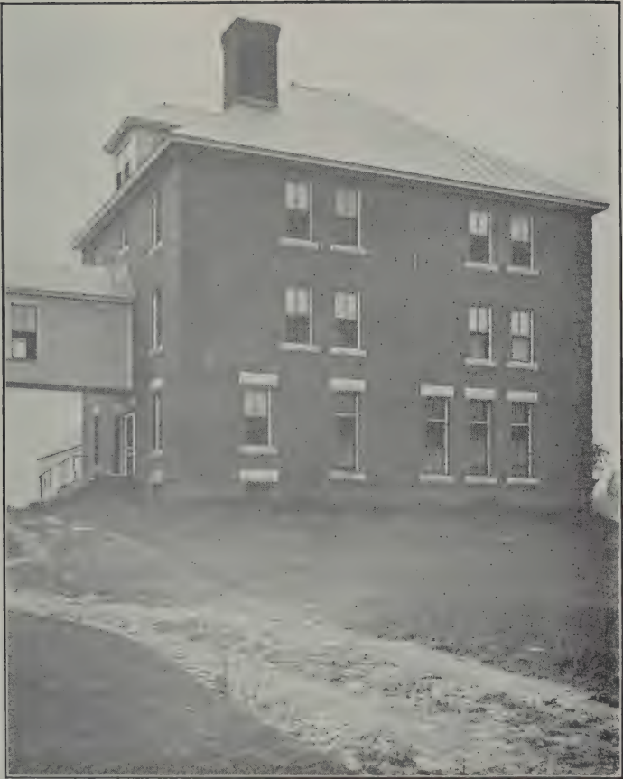
CARROLL COUNTY JAIL BUILDING AT OSSIPPEE