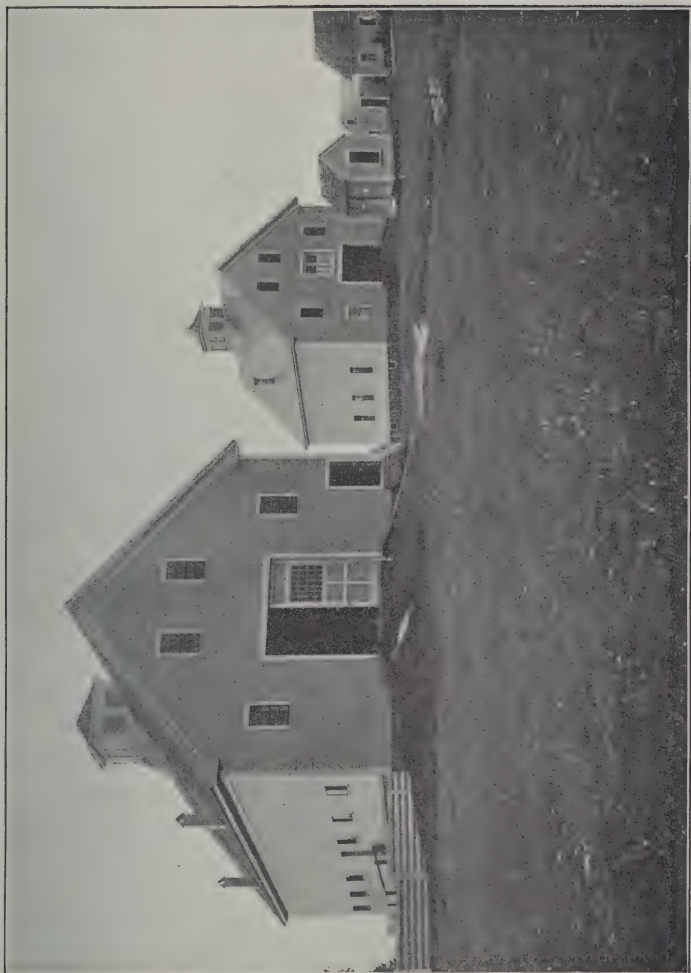
CARROLL COUNTY FARM STABLES AT OSSIPPEE