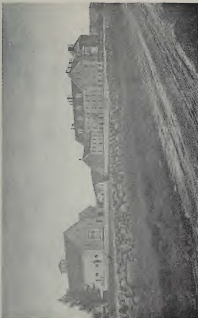
GENERAL VIEW CARROLL COUNTY BUILDINGS