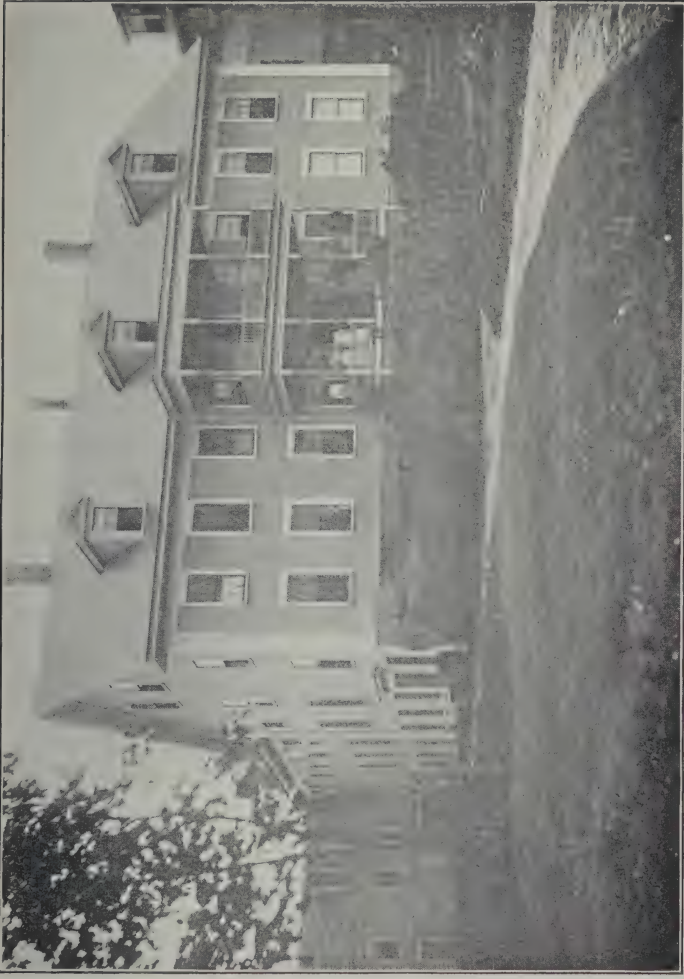
CARROLL COUNTY FARM HOUSE AT OSSIPPEE