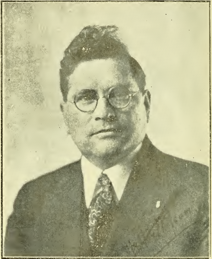
HON. ELI J. KING, MAYOR