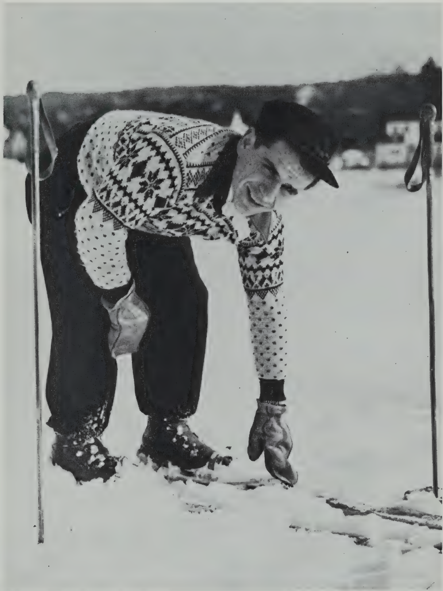
RALPH TOWNSEND 1948 Olympic Skier