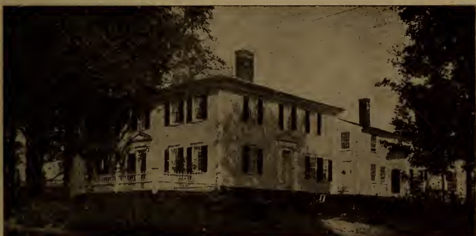
FRANKLIN PIERCE HOMESTEAD, HILLSBOROUGH, N. H.