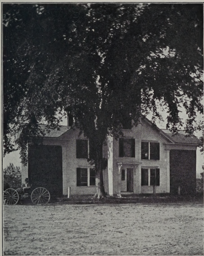
CARROLL COUNTY COURT HOUSE, OSSIPEE, N. H.