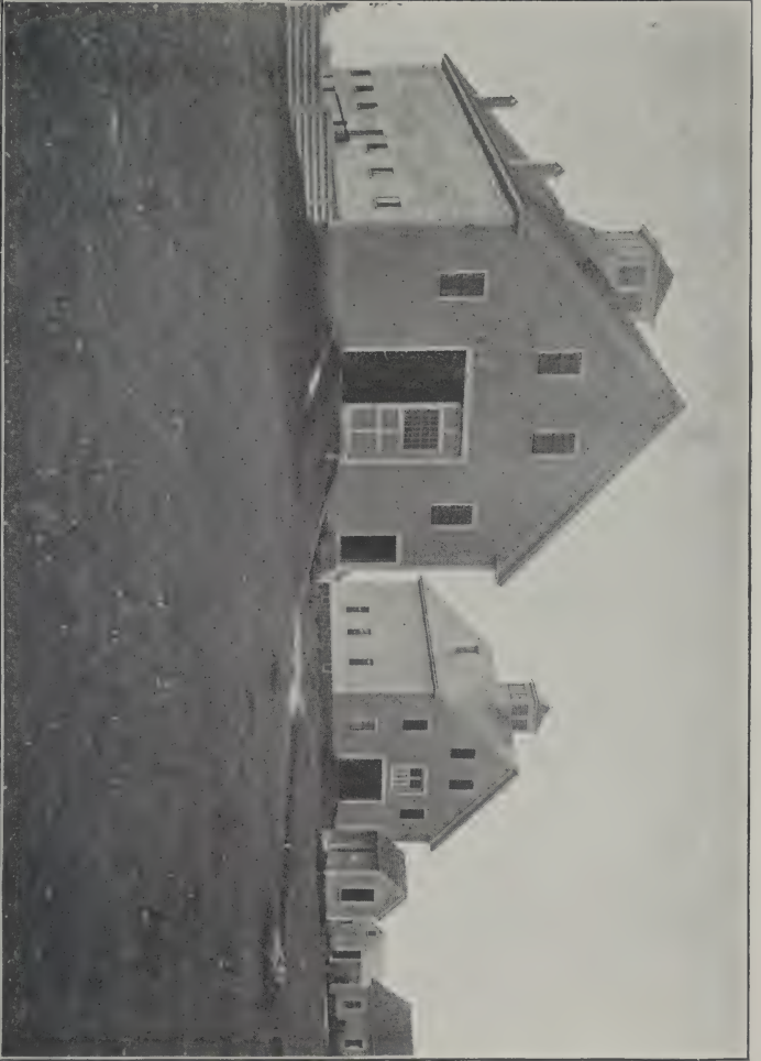
CARROLL COUNTY FARM STABLES, OSSIPPEE, N H