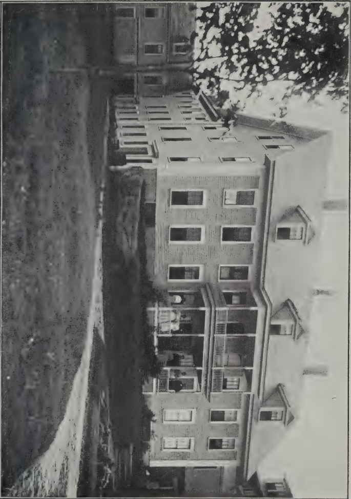
CARROLL COUNTY FARM HOUSE, OSSISPEE, N. H.