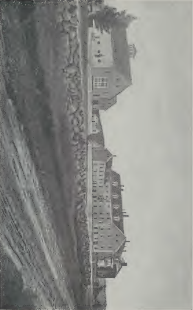
GENERAL VIEW CARROLL COUNTY FARM BUILDINGS, OSSIPPEE, N. H.