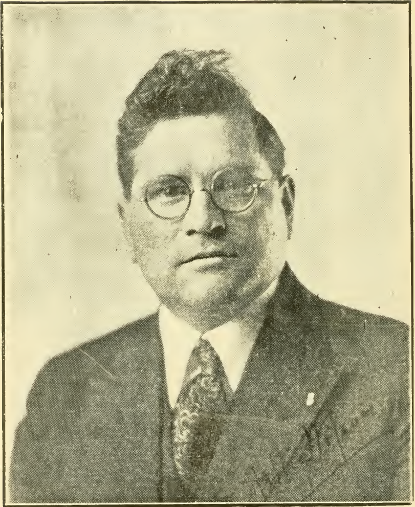
HON. ELI J. KING, MAYOR