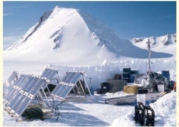
Previous ice core expeditions, like this one in the Canadian Yukon, are part of an effort to understand climate variability across the entire Arctic region.

Ice cores have been drilled in Penny Ice Cap and Devon Ice Cap—both in the Eastern Canadian Arctic, and at three elevations in the Saint Elias range in the Yukon. One more field season is expected at Denali next year—to download data from the weather stations—and scientists then hope to begin the deep-drilling program in the spring of 2010, should the NSF fund the second phase of the project. The team hopes to recover surface-to-bedrock ice cores from glacial ice that is about 1,000 feet thick. This length of core should provide a detailed record of climate and environmental change extending back several thousand years.