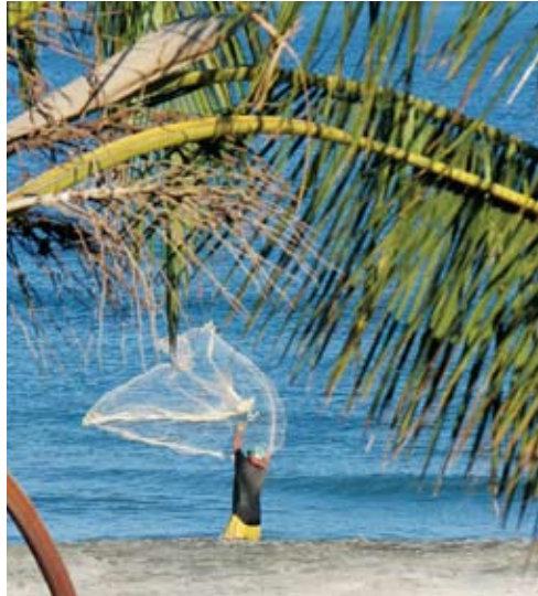
A fisherman casts a net from the shoreline near Santa Marta on the Colombian Caribbean coast.