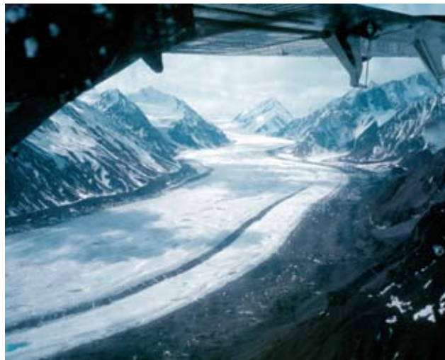
The Saint Elias Mountains from the window of a Twin Otter aircraft en route to an ice core drill site in May 2002.