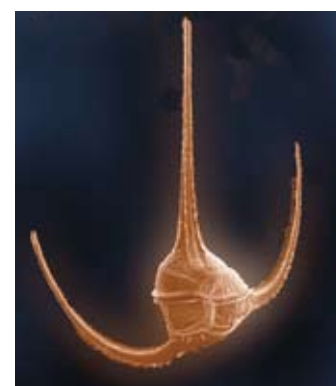
The dinoflagellate Ceratium longipies, a common phytoplankton in the Gulf of Maine.