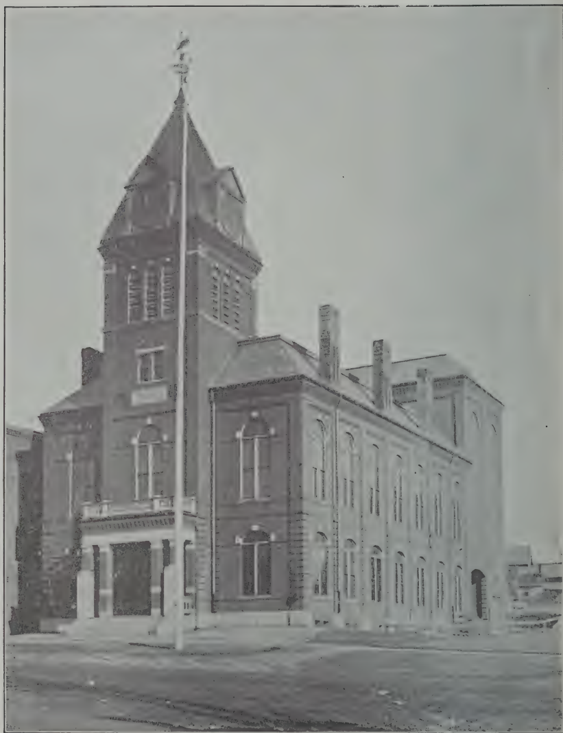
SULLIVAN COUNTY COURT HOUSE AND NEWPORT TOWN HALL