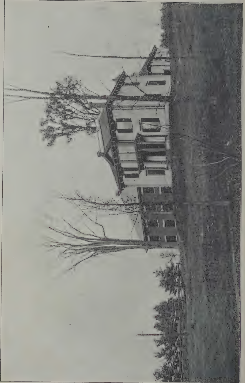
JAIL AND RESIDENCE