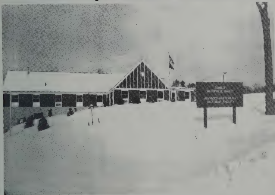
Advanced Wastewater Treatment Facility