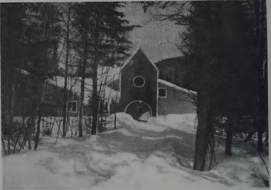
New Elementary School