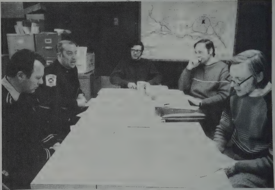
Town government in action