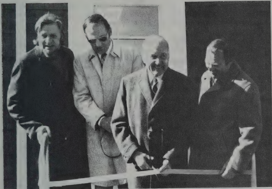
Ribbon cutting at Wastewater Treatment Facility