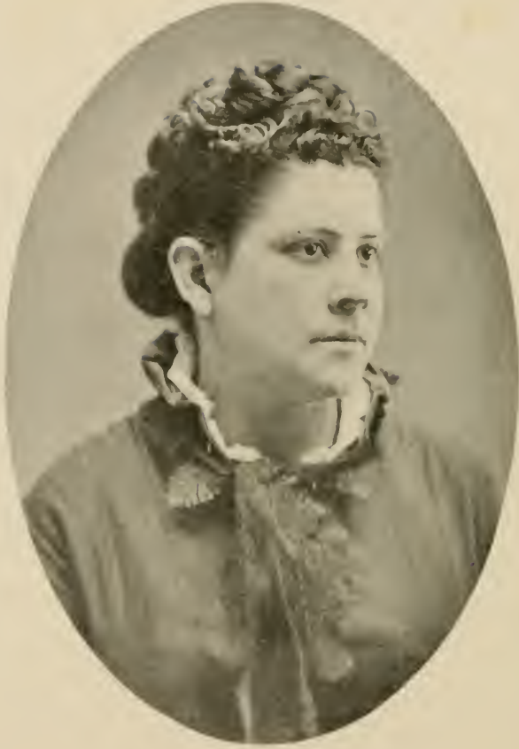
THE GIRL I LEFT BEHIND ME