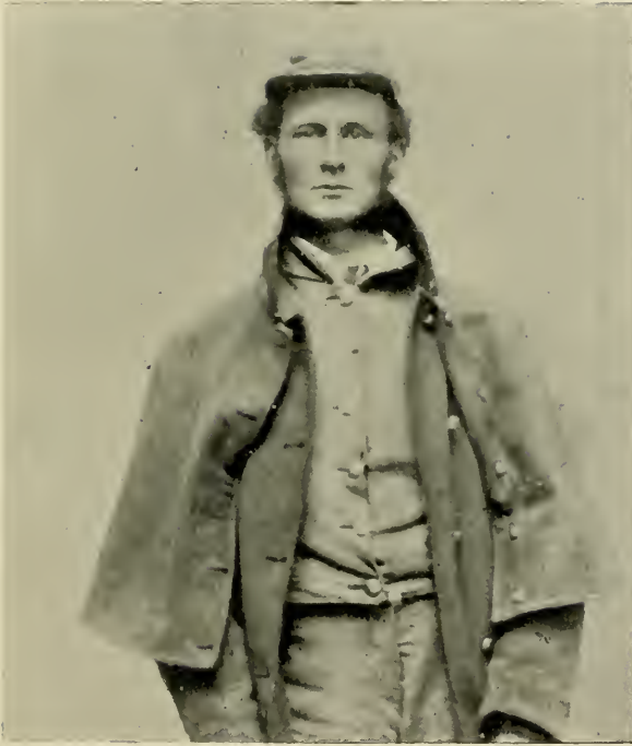
THE SOLDIER BOY