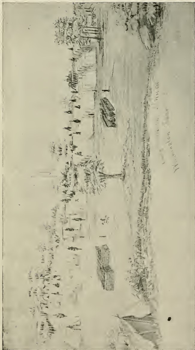
CAMP SULLIVAN, WASHINGTON