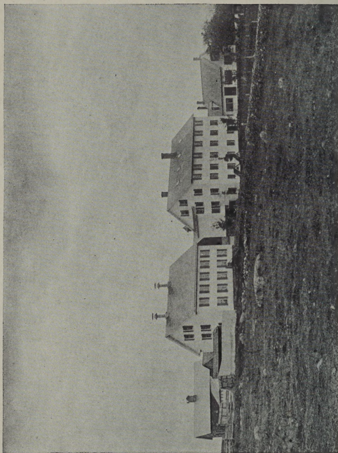
SULLIVAN COUNTY FARM BUILDINGS.