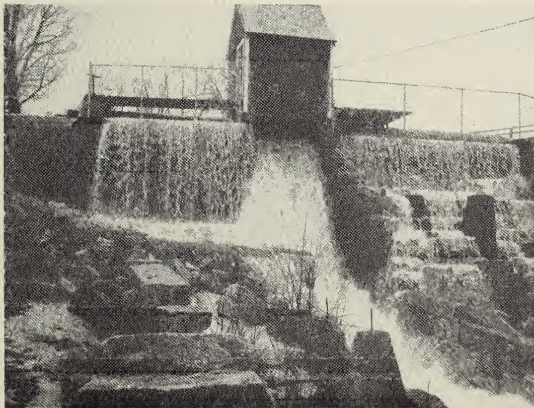
By the Mill Pond Dam