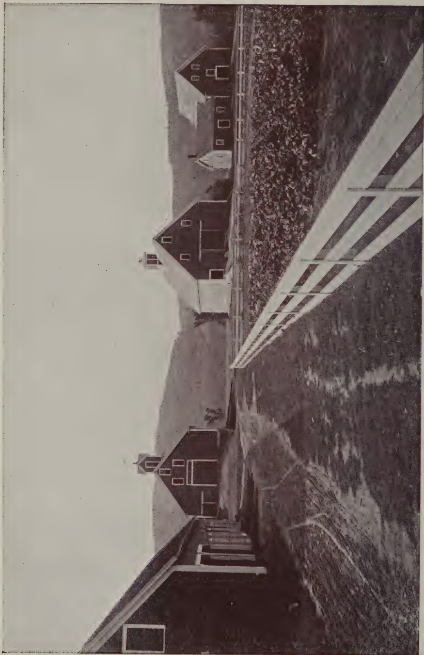
GRAFTON COUNTY FARM BUILDINGS