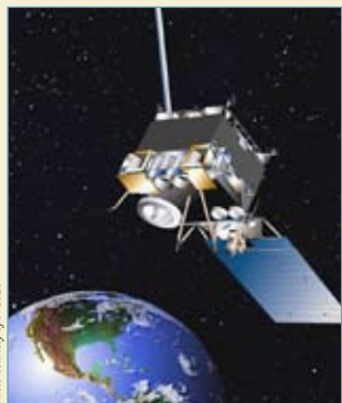
Artist's conception of GOES-N satellite by Allan Kung.