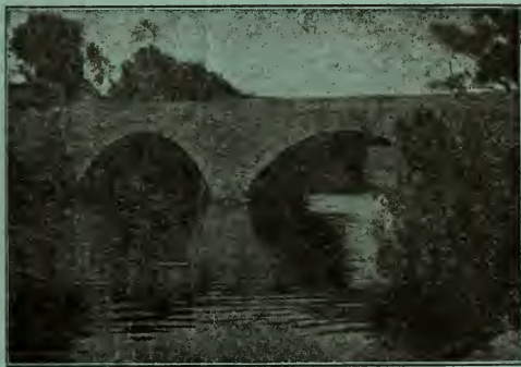
STONE BRIDGE BUILT NOVEMBER, 1835 DESTROYED BY FLOOD, SEPTEMBER 22, 1938

FOR THE FISCAL YEAR ENDING JANUARY 31, 1939