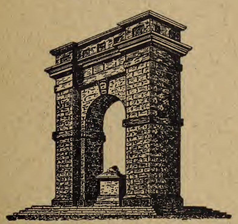
C. E. TILTON MEMORIAL ARCH Northfield, New Hampshire