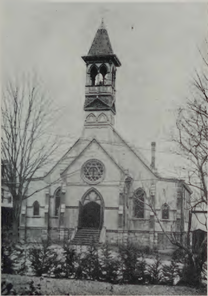
Sacred Heart Church