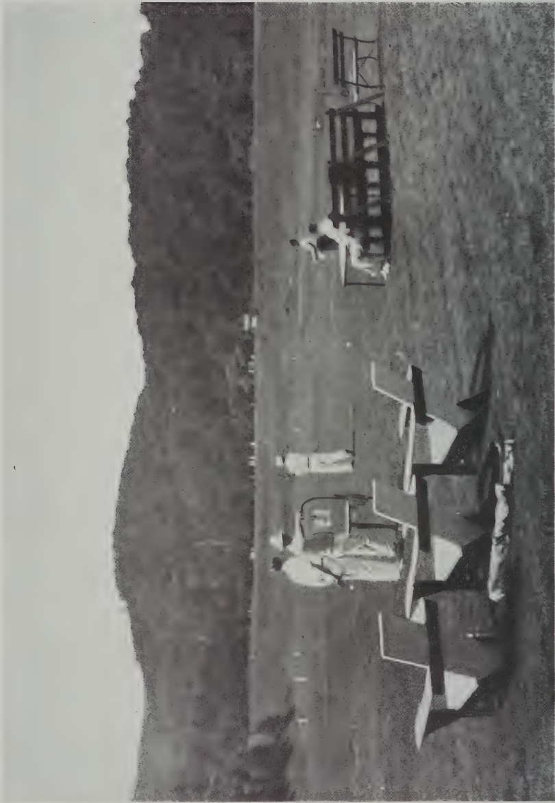
Carter Country Club