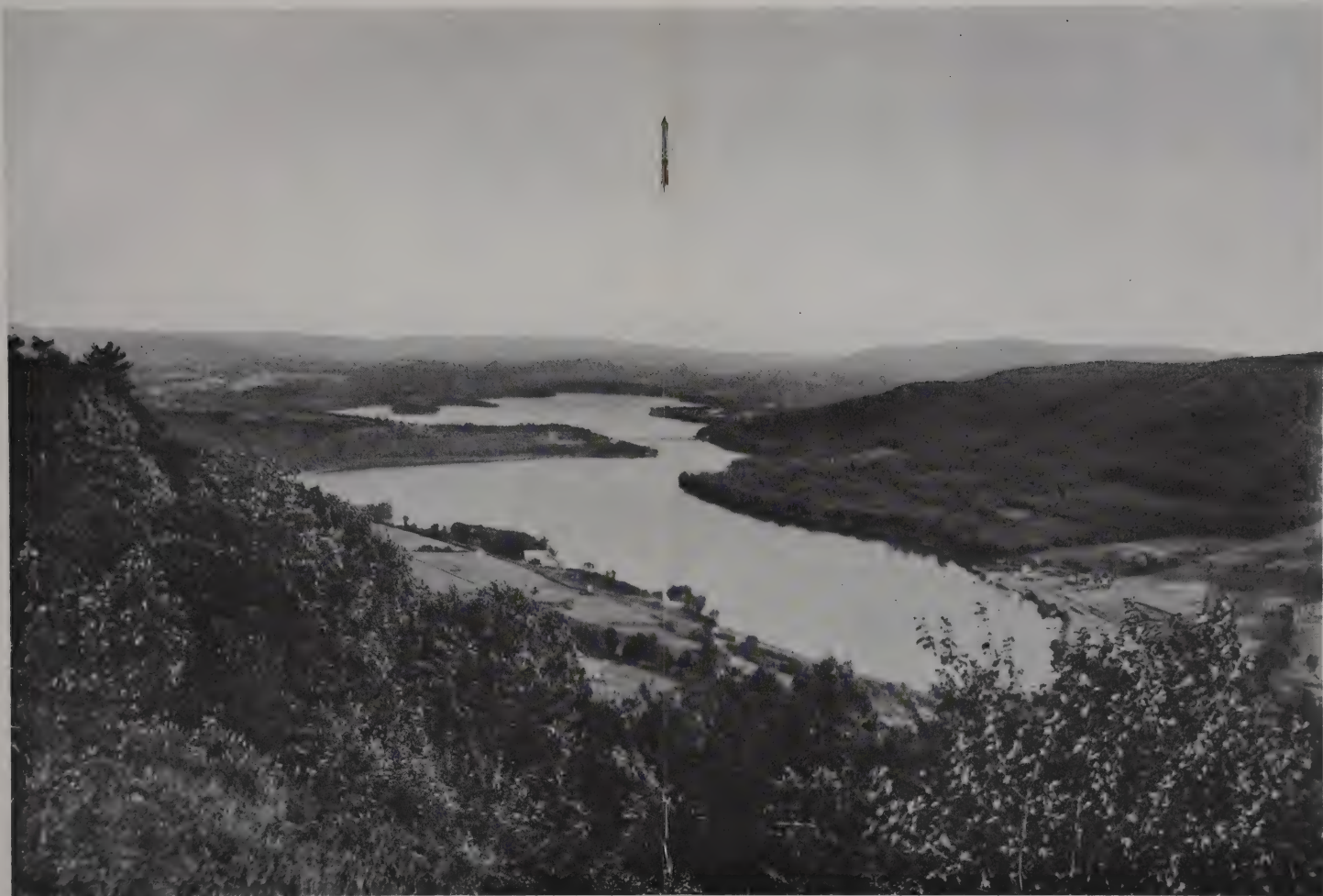
Mascoma Lake, Lebanon and Enfield