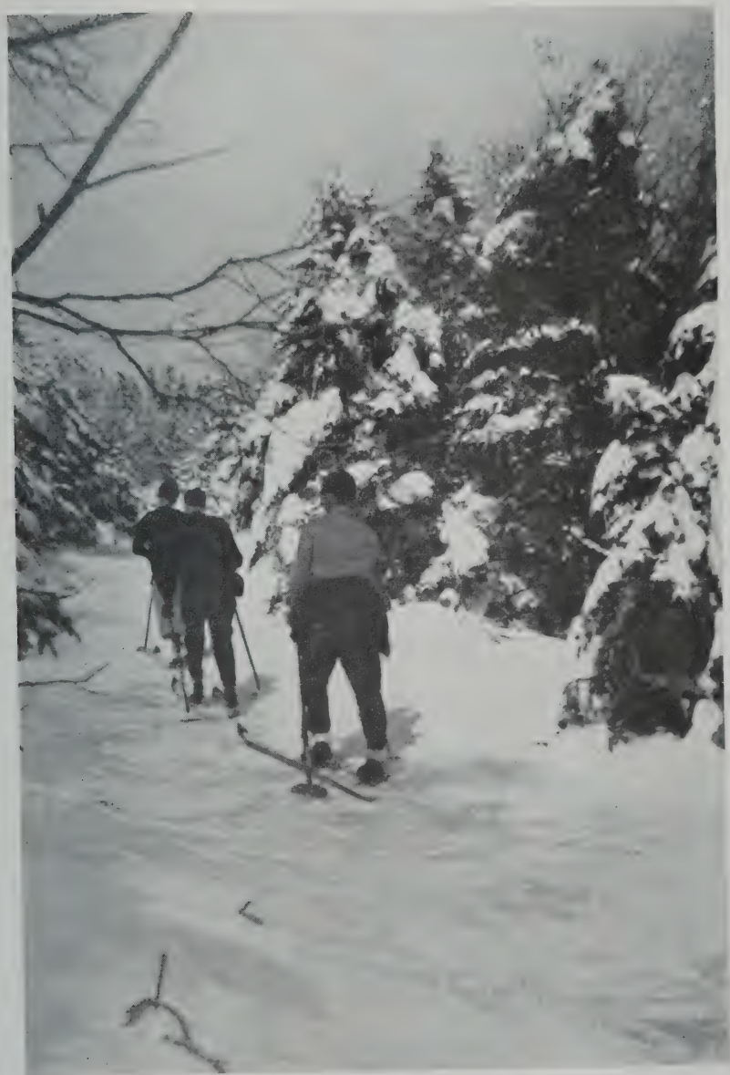
A Familiar Scene About Town