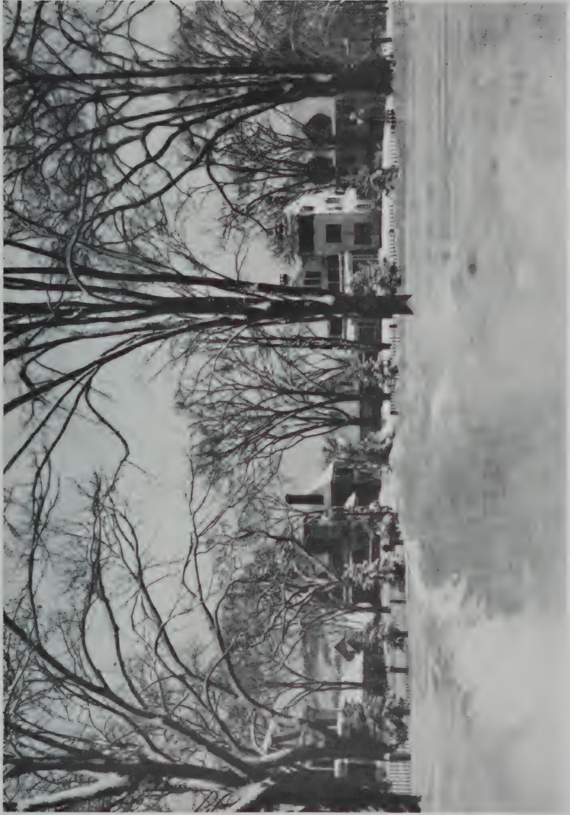
Looking East from Colburn Park