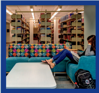
Engineering, Math & Computer Science Library (Kingsbury)