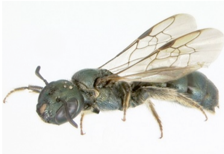
The small carpenter bee, Ceratina calcarata.