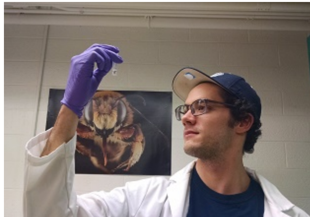
The author examining a Ceratina calcarata specimen in the UNH Bee Lab.

Recently there has been rising concern that the activities of humans have had a negative effect on native bee populations, and that many bee populations in North America are in decline. This is important because bees provide global pollination services estimated at roughly $160 billion U.S. dollars annually (Gallai et al., 2009). Native bees are especially good at pollinating certain plants, like tomatoes and blueberries, because of their capacity to sonicate, or vibrate at certain frequencies to loosen the pollen and make it easier to collect, something that honeybees are incapable of doing (Greenleaf & Kremen, 2006). By studying native bees, we can hopefully begin to change our lifestyles to ensure their survival and well-being in order to ensure, in turn, our survival and well-being.