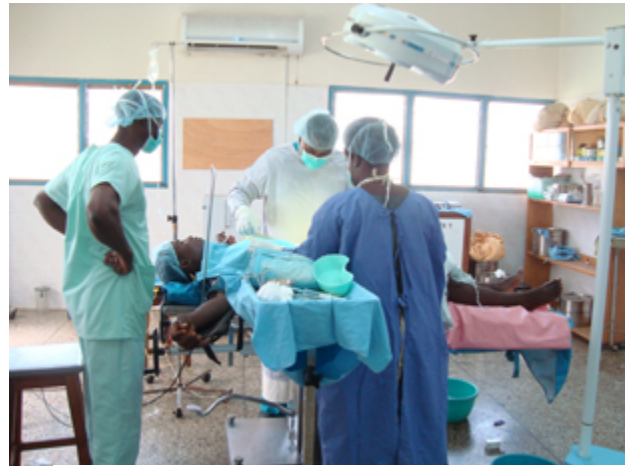
Witnessing my first surgery in Ghana at the clinic in my home town of Asamang.

Embedded in these Ghanians, not only the healthcare workers but something I also gleaned from spending time with the people as a whole, is a deep sense of pride in their country. These people couldn't leave their homes, not when they felt they could bring about positive change. The concept of the family is so powerful that familial reasons also influence them to stay. There is an innate obligation to support and be around their family unit, to stay and support their countrymen. In the words of one interviewee, "there is no praise, no thank you, no principal reward, but we can get thanks from our patients for doing work, and that makes it worth it."