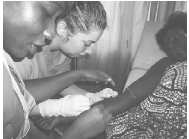
The author inserting her first IV in a post-delivery patient.

The smell of antiseptic was the first familiar thing I had encountered since arriving in Ghana. From my personal and clinical experiences, I had come to assume that operating rooms would be pretty standard worldwide—immaculate and orderly. I had connected the smell of that antiseptic with this ideal, and was shocked when my first surgery experience was a scene that depicted a naked patient, flies crawling on his cheeks, his stomach opened on a rusty table overseen by a nurse anesthetist who was wearing flip-flops. With this experience I began my research on the anesthesia providers currently practicing in Ghana. What I found was that their work satisfaction levels vary greatly from urban to rural settings, emigration is heavily tied to poor remuneration and lack of educational opportunities, and, most prominently, that the anesthesia field in this country is an extremely selfless profession.