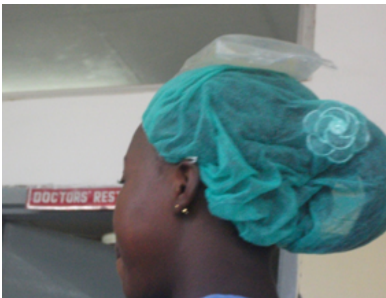
An innovative way of transporting IV fluid for a patient in transit.

Concerns about the work environment were noted by nurse anesthetists in both the urban and rural settings. Even in the teaching hospital, which sets the standard for anesthesia care, there are occasional shortages in equipment and staffing. For those clinics that were more rural, problems ran from a lack of equipment to a lack of power. Surgery and anesthesia are often performed by intuition rather than science, as monitors and equipment are either scarce or nonfunctional. Proper sanitation techniques are also hard to adhere to, and although there are few deaths caused directly by anesthesia, many patients suffer complications related to prolonged surgery times and infection.