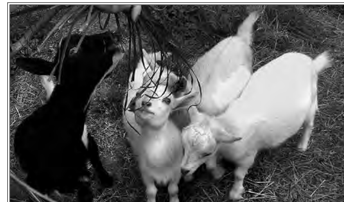
Misty Hill Farm