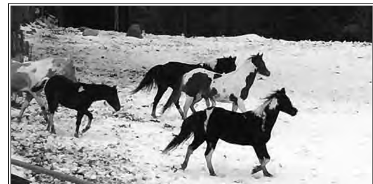
Mountain Lane Farm