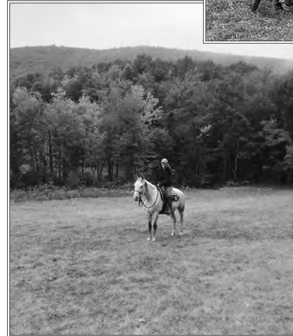
Mountain Lane Farm