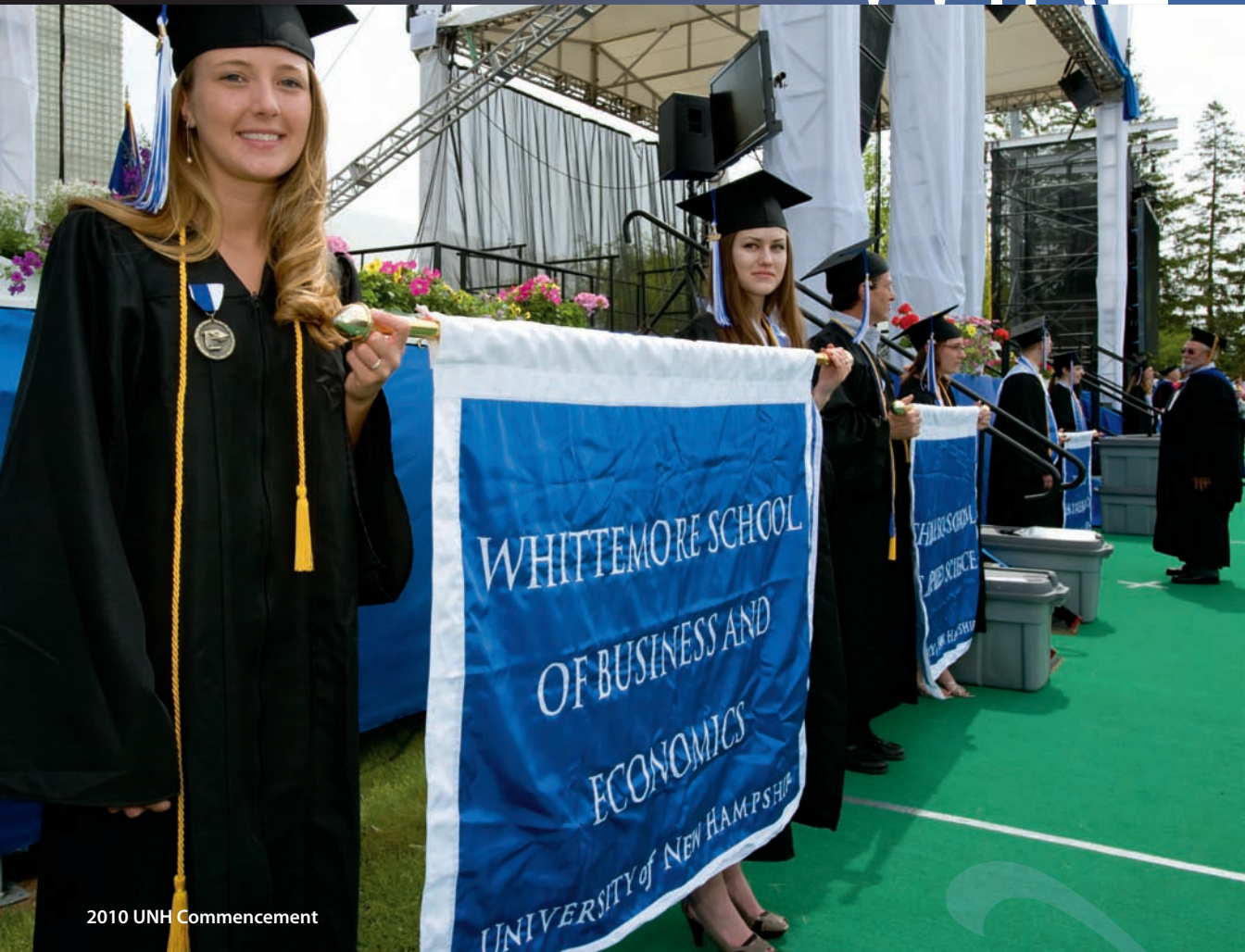
2010 UNH Commencement