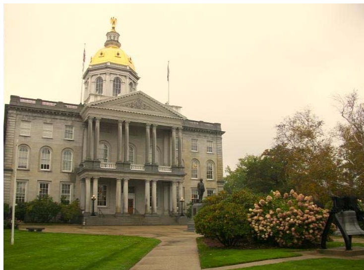
The New Hampshire State House on a cloudy summer afternoon. The legislative and executive branches of government meet here, but the judicial branch has its own building on the other side of town.

was fading and if New Hampshire was destined to return to the era of court-clearing—of a Supreme Court embroiled in the realm of politics. I stepped outside of the law school into a dreary, drizzly Concord. The sun, invisible behind the thick gray clouds, was setting. Carefully sidestepping the deep puddles that checkered the sidewalks, I began my walk back to the car, and it was not long before I reached the State House lawn. Since I first set foot on that lawn during a fourth-grade field trip, the edifice has always seemed to command me to stop for a moment and stare, perhaps out of respect for its simple grandeur or for the history that has been made within its walls. As always, my feet obeyed. The golden dome forced my eyes upward, but I soon tore them away to look across the street at the State Library. I smiled at the irony of the Supreme Court moving back into the shadow of the State House to escape the shadow of court-clearing, that old specter that has chased it down through the centuries. Although I cannot guess what the future has in store for the New Hampshire Supreme Court, my summer research has convinced me that the events of the nineteenth century are as important to understanding it as the politics of the twenty-first century.