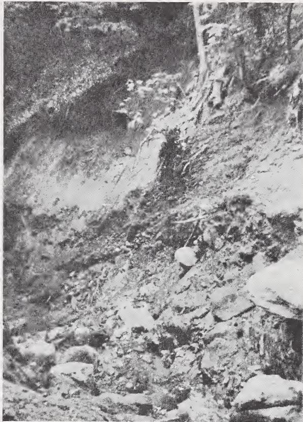
Ferry Hill Road washout

July 5, 1973 NUMBER 22 15c VALLEY PUBLISHING CORP. 877, WHITE RIVER JUNCTION, VT. 05501 Strike Again; Damage: $300,000; Highway Cut Off