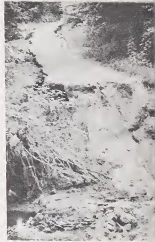
Old County R