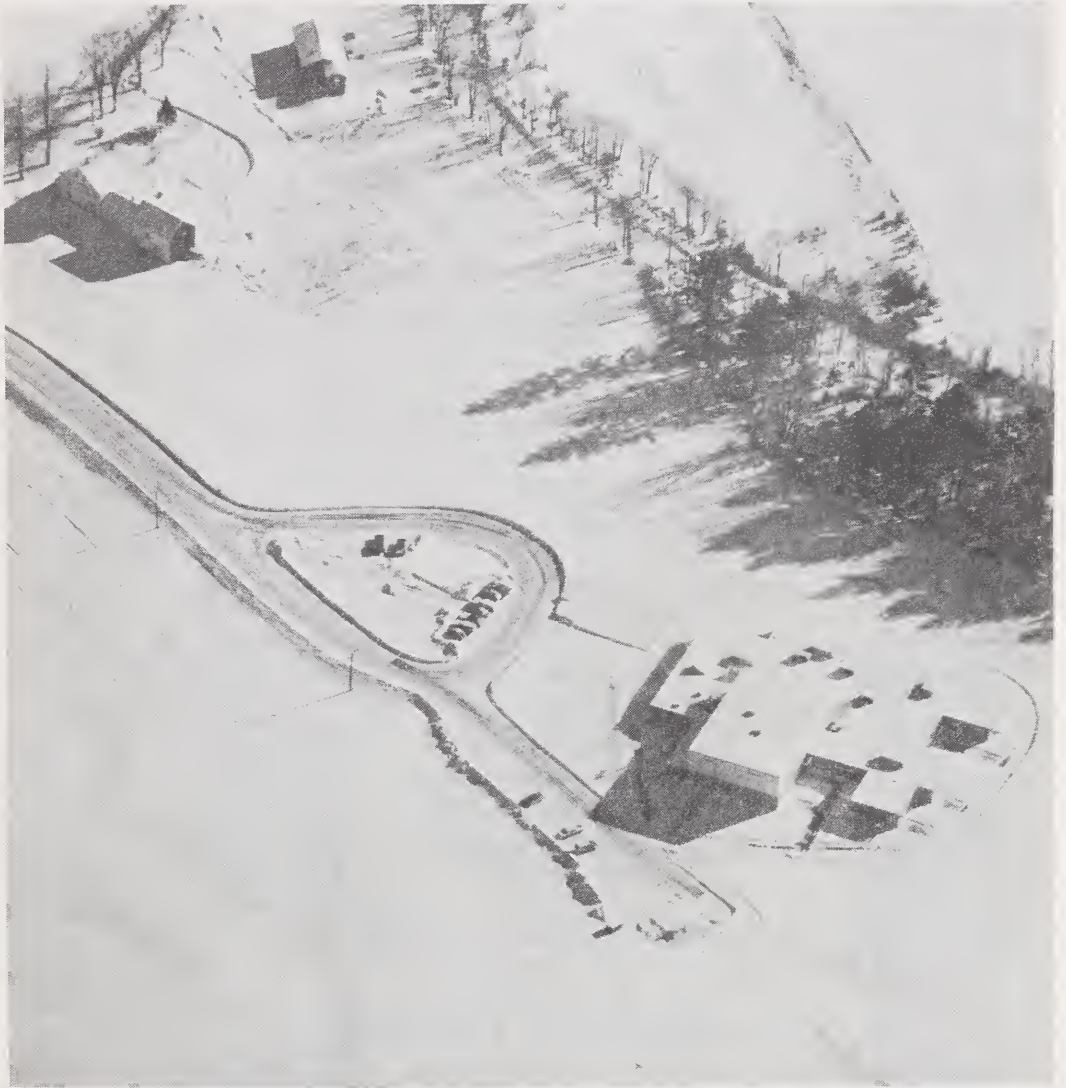
PLAINFIELD'S NEW SCHOOL – The brand new Plainfield School opened its doors to students in September 1973. The new facility was built at a cost of $665,000, financed by a bond issue approved by School District voters in May 1972.