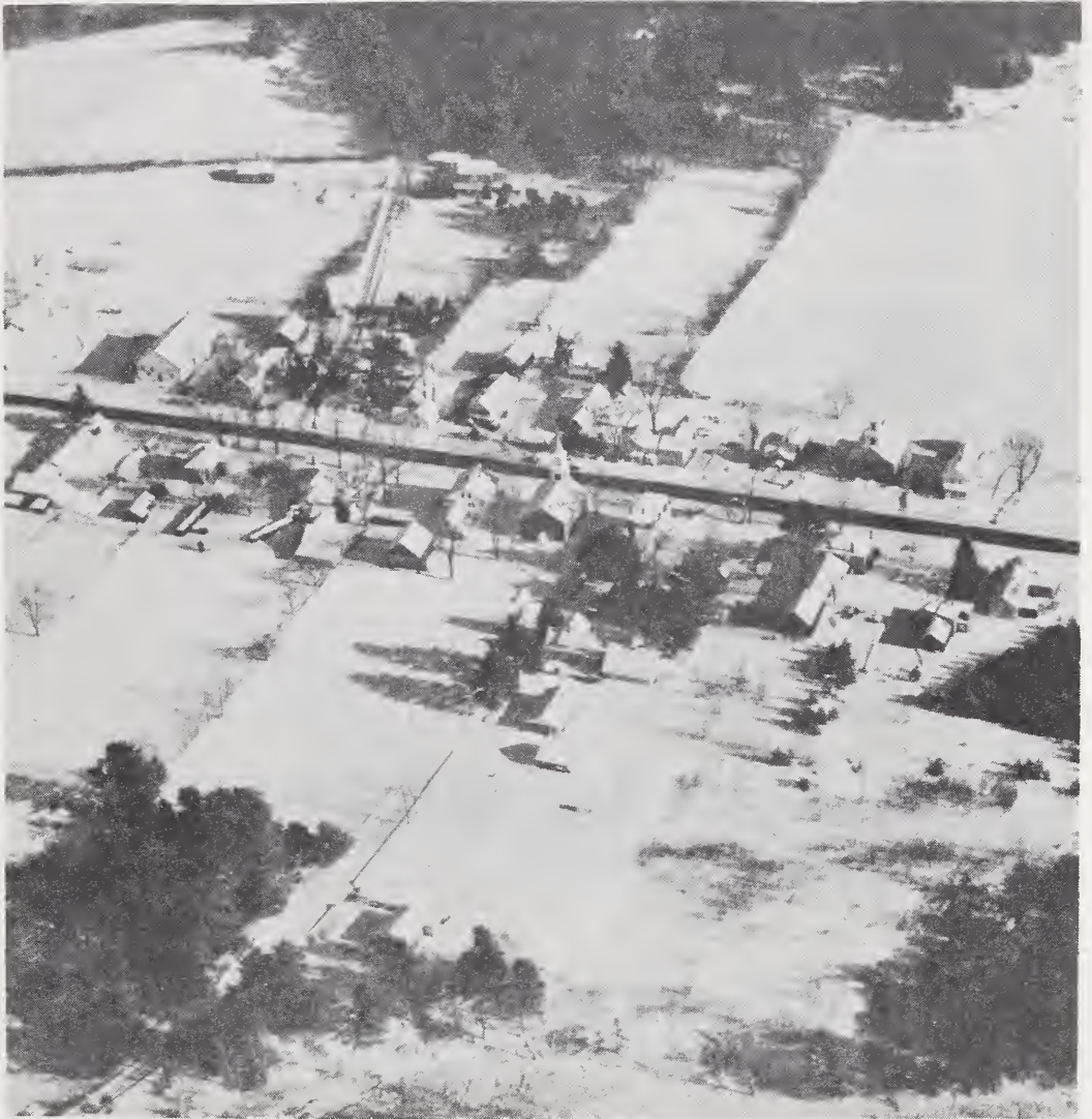
PLAINFIELD PLAIN FROM ALOFT – This aerial view of the village of Plainfield Plain was taken from a point west of the village, approximately over Sugar Hill.