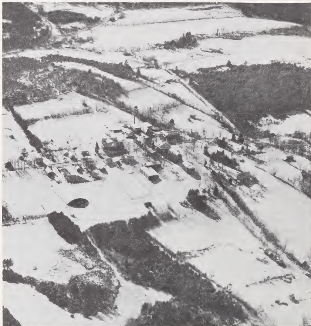
MERIDEN VILLAGE AREA – This aerial view of Meriden Village is taken from over the Chellis Hill area looking southwestward. Main Street runs from left to right.