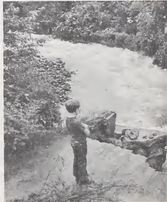
Hell Hollow b