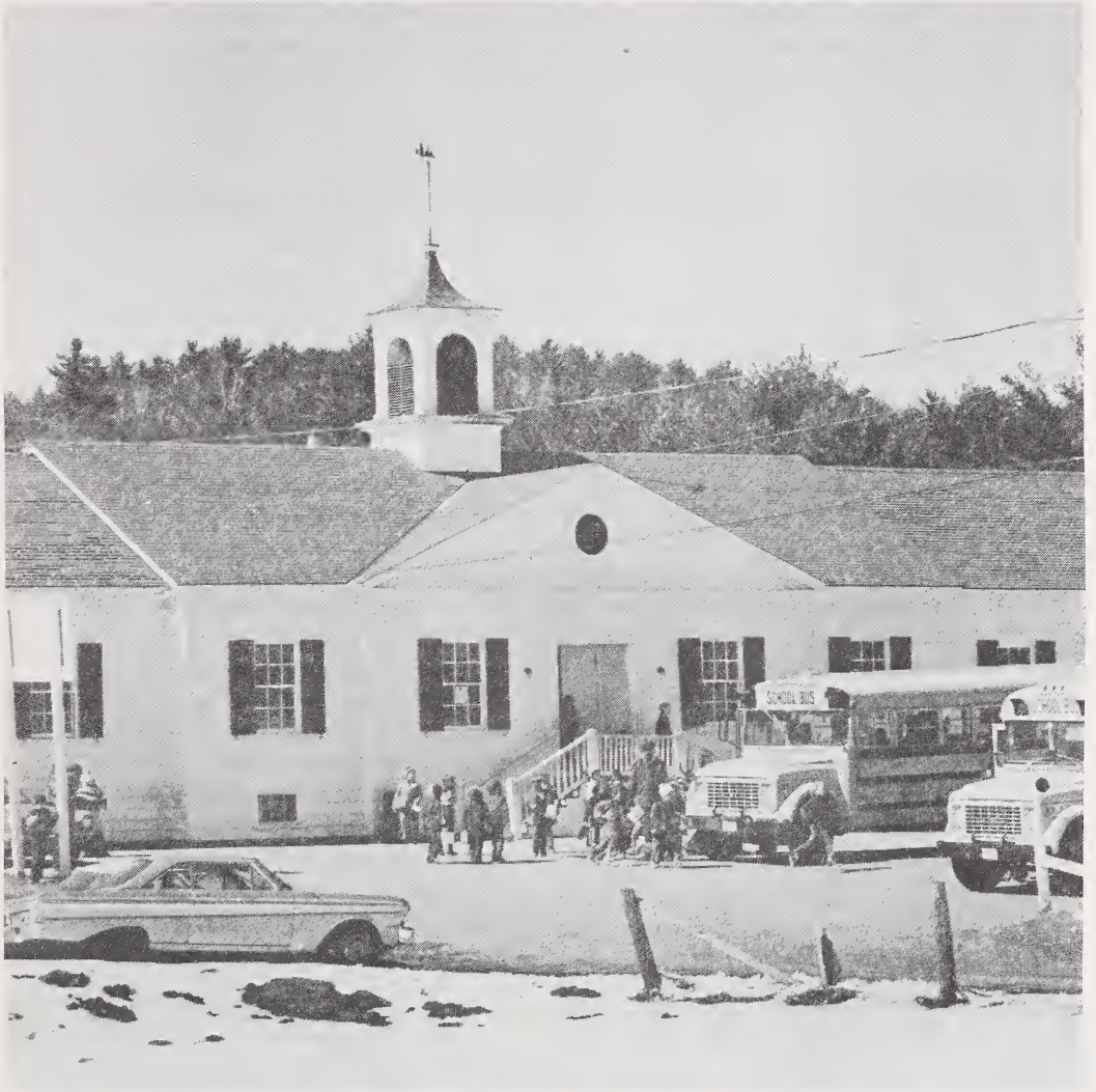
FAREWELL TO PLAIN SCHOOL – Youngsters in Grades 1 through 4 attended the last classes to be held in the Plain School during 1973. Pupils in the upper four grades completed studies in June at the Meriden White School, and all eight grades moved into the new Plainfield School in September.