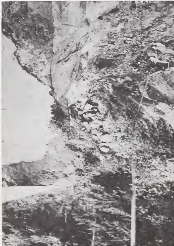
Gates Hollow culvert—destroyed