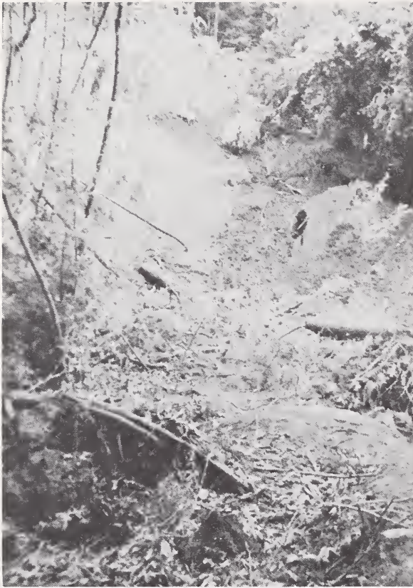
Landslide on River Road, near Annal Meadow