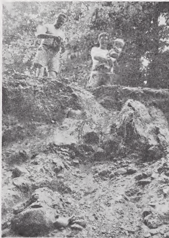
Sightseers peer down into gully