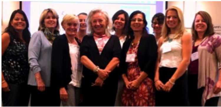
PIRC Consortium members from UMass-Boston, Brandeis and Dartmouth, with PIRC staff.

The PIRC Campus Sexual and Relationship Violence Prevention Consortium (Consortium) is a project of Prevention Innovations Research Center (PIRC) with university and college campuses across the United States. The Consortium provides members with training, prevention strategies, technical assistance and evaluation tools to assess and effectively address sexual and relationship violence and stalking in their communities. Technical assistance is provided by leading researchers and practitioners in the prevention, direct services, and compliance fields and is grounded in research, theory and evidence-based evaluation. The Consortium offers participants the opportunity to be in discussion with and part of a cohort of institutions working to end sexual and relationship violence and stalking on campuses.