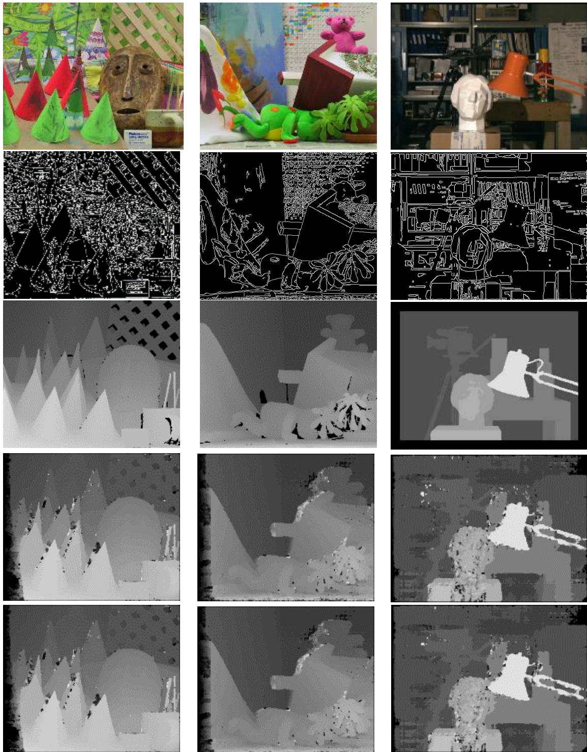
Figure 2 Experiment Results. Top to bottom row: image, Canny edges, ground truth, SGM depth map and depth map obtained by the reported algorithm.