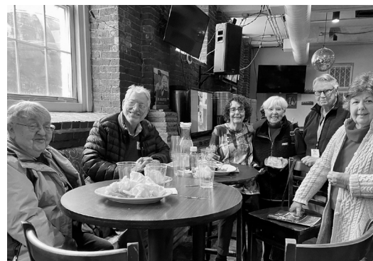
Greater Manchester Lunch Bunch

Please reach out to the contact listed below to learn more about the group and their meetings throughout the term!