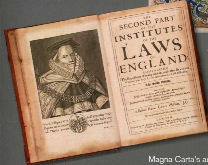
The Second Part of the Institutes of the Laws of England (1681)

Magna Carta's admirers have seen in it the origin of many enduring constitutional principles: the rule of law, the right to a jury trial, the right to a speedy trial, freedom from unlawful imprisonment, protections from unlawful seizure of property, the theory of representative government, the principle of "no taxation without representation," and most importantly, the concept of fundamental law—a law that not even the sovereign can alter.