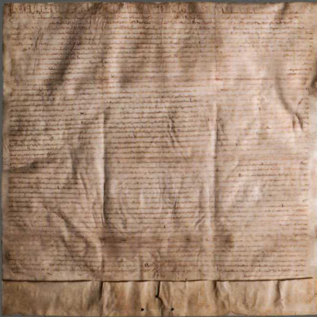
Lincoln Magna Carta

M agna Carta is the charter of liberties that England's King John granted to his barons in 1215. In the centuries since its creation, Magna Carta has become one of the most enduring symbols of liberty and the rule of law.