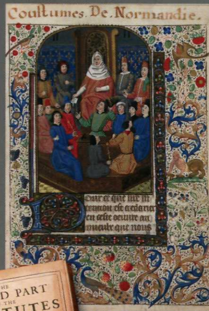
Grand Coutumier de Normandie (The Collection of Norman Customary Law, 15th century)

Although in many ways Magna Carta belongs to the medieval society that created it, some of the most important people in our constitutional history have found in it an ancient precedent for the marriage of individual rights and constitutional government that has characterized the rise of the modern world.