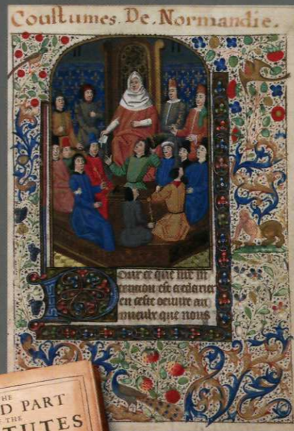
Grand Coutumier de Normandie (The Collection of Norman Customary Law, 15th century) Law Library of Congress

Although in many ways Magna Carta belongs to the medieval society that created it, some of the most important people in our constitutional history have found in it an ancient precedent for the marriage of individual rights and constitutional government that has characterized the rise of the modern world.