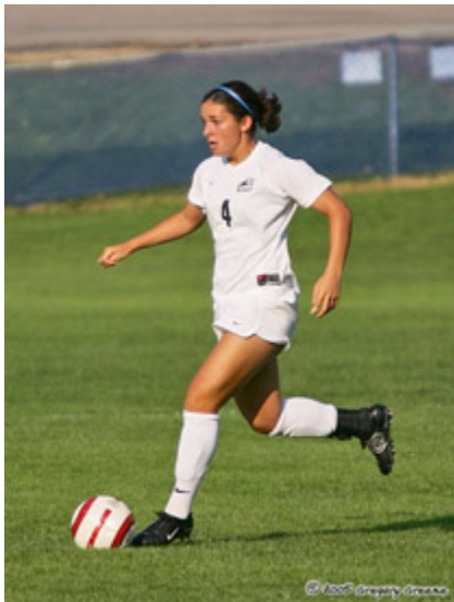
The author in action on the soccer field

Due to my love for soccer and school I have always focused on my grades, performance, and health. Therefore, I never fully understood why so many athletes participated in what I perceived to be heavy, or binge, drinking. During my four years of college I was a member of the University's women's soccer team. I was always an advocate for voicing the negative effects of alcohol on both health and performance but had not publicly spoken out on the subject. Not until my junior year, when I lost an athlete peer to alcohol, did I realize the severity of the problem.