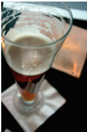
One glass is often not enough.

"Like freshman year I would black out and that was my issue but then as you get older and other people are looking up to you, and as a captain blacking out, even though I could do that and play the next weekend and it wouldn't affect me, I know it would affect some other freshman and now I am a role model to them. So THAT for me made it not ok." [Informant 3]