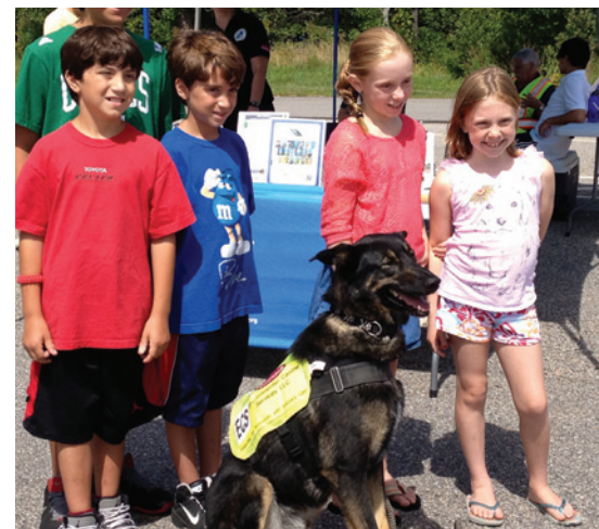
Sable meeting with some young fans in Kittery on Aug. 7th

two furry data collectors, Sable and Logan. Dog's noses are amazing detection tools. By sniffing outflow pipes and areas where stormwater or wastewater discharges into rivers, estuaries, and beaches, they can tell if it's contaminated with harmful bacteria. More importantly — and most incredibly — they can distinguish whether the bacteria are from humans. Using the dogs' detection powers in conjunction with other scientific instruments is a cost-effective and highly accurate method of rapidly identifying sources of bacteria from sewage. Recently, an area of beach and tide pools near Fort Foster in Kittery was found to have levels of bacteria above the safe levels set by state water quality standards. It was unclear what kind of bacteria was present or where they were coming from. Sable and Logan were able to confirm that the bacteria were from human waste, and the source was tracked to an abandoned outhouse back in the woods that was leaking into the wetland above the beach. Since this discovery, the Town of Kittery has pumped out and sealed the outhouse to prevent further contamination and the bacteria levels have dropped a lot. Logan and Sable aren't just excellent scientists with their own built-in sensor equipment; they're a furrier, friendlier connection between science and the people who stand to benefit from a better understanding of impacts to the local waterways and beaches.