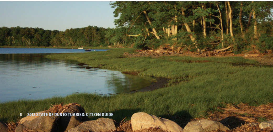
Great Bay in Summer

small, but a single garden can soak up the water from impervious surfaces of an average single family home.