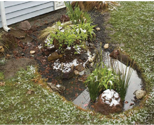
A residential rain garden