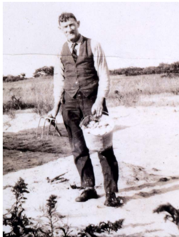
Figure 4 Seabrook resident clamming in Seabrook Harbor 1916

As in previous years, GBCW volunteers have provided not only a valuable source of manpower for NHDES Shellfish Program personnel but have also proved themselves to be an exceptional conduit for information. While working at their sampling sites or in their communities, GBCW volunteers have ample opportunity to converse with neighbors and visitors about the work they are engaged in. These conversations provided the impetus behind the Estuarine Education Series