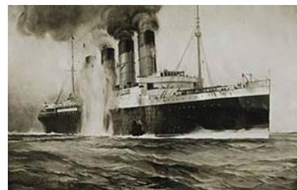
Torpedoed Lusitania