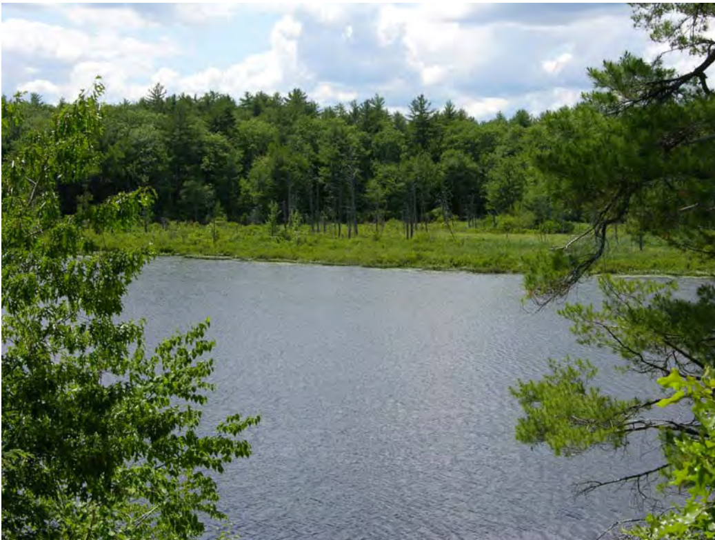
4. This is a view of the central portion of Wetland #7 from the east side of the pond.