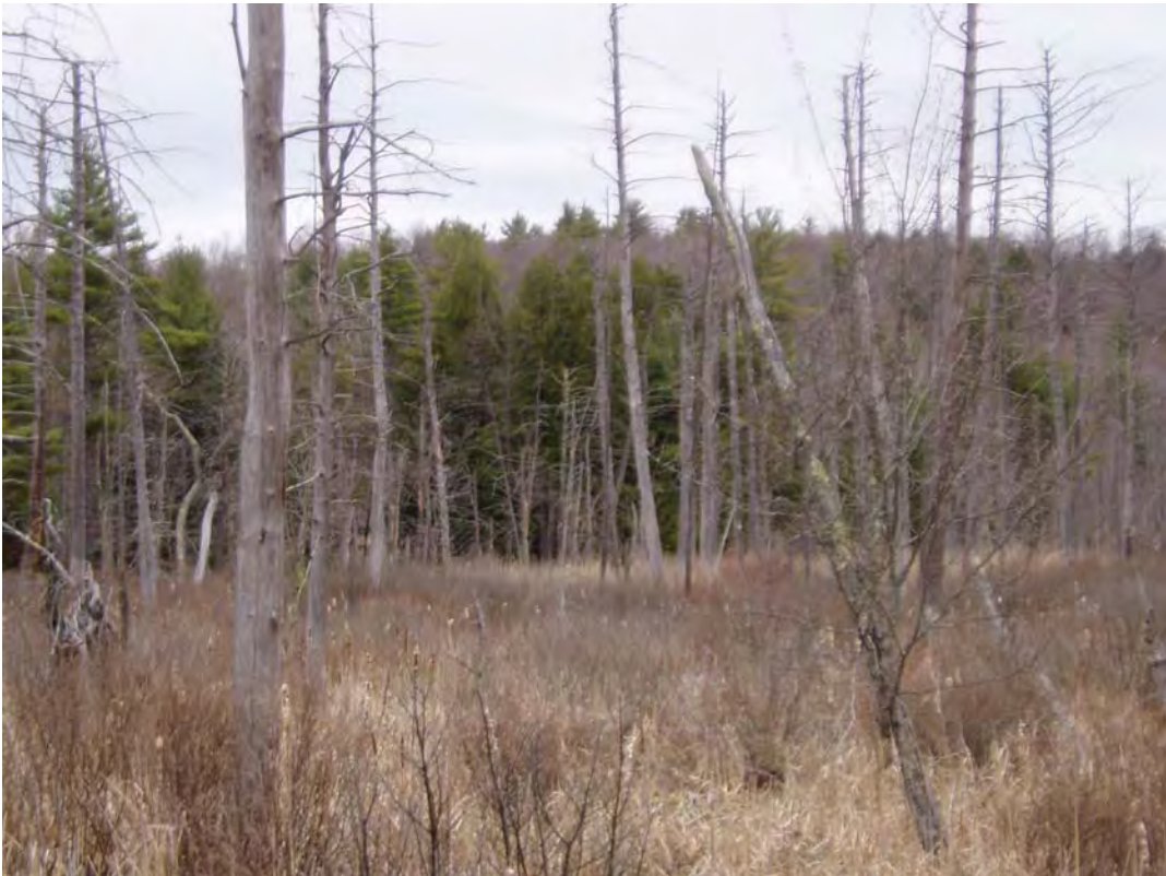
4. Snags provide a valuable habitat feature within much of Wetland #9a.