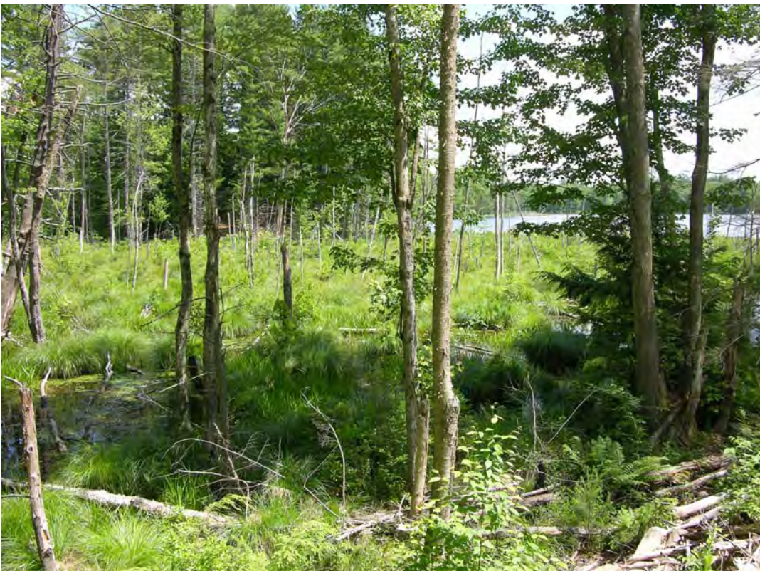
4. This is a view of the southwest portion of the wetland with Cub Pond in the background.