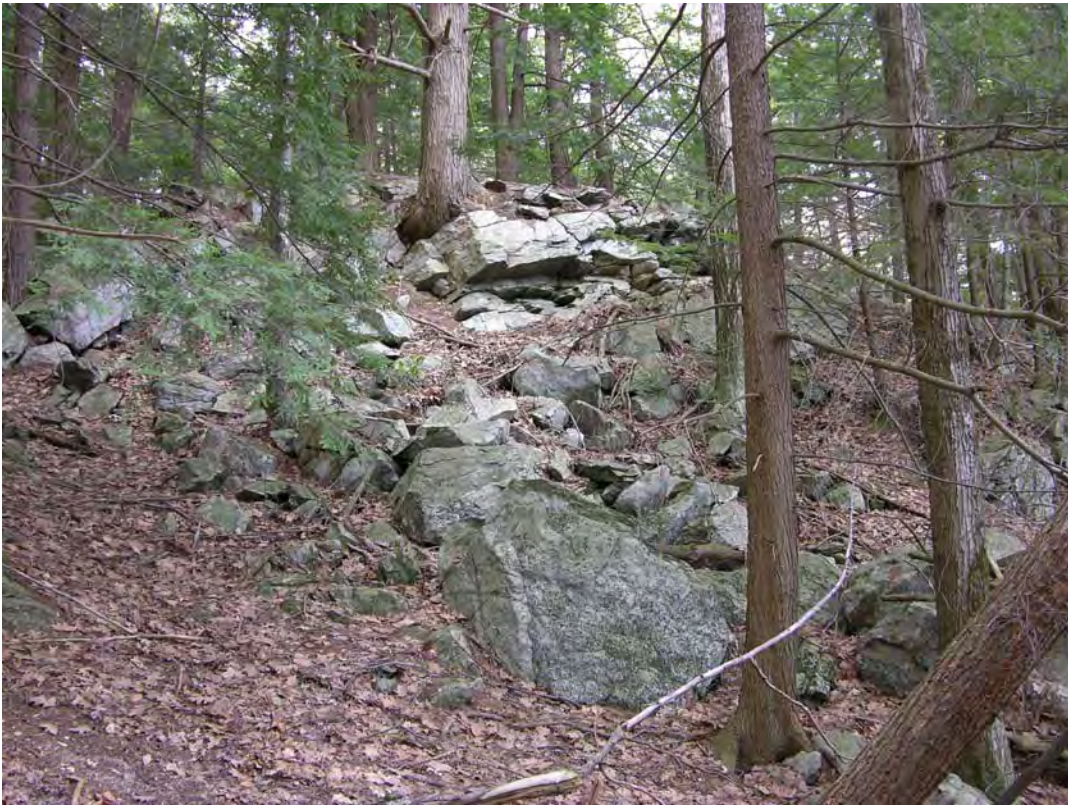
3. Upland bordering this portion of the wetland includes rock outcrops and surface boulders.