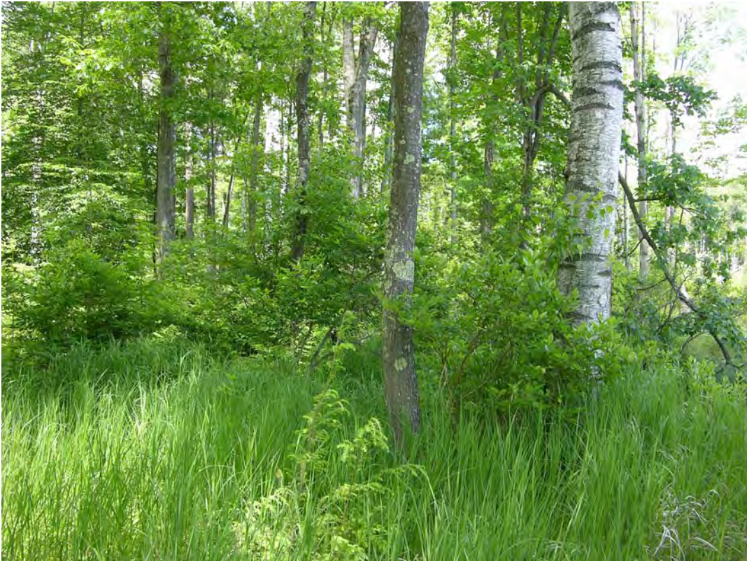
3. This wetland has a transitional forested wetland along its northern boundary.