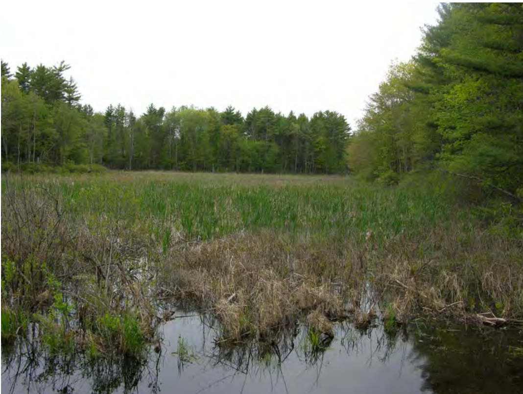
6. The southern portion of the wetland is dominated by a cattail marsh.