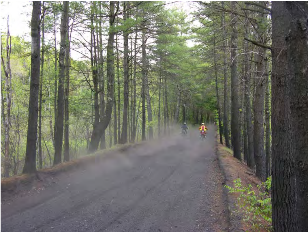
5. A state ATV trail bisects this wetland.