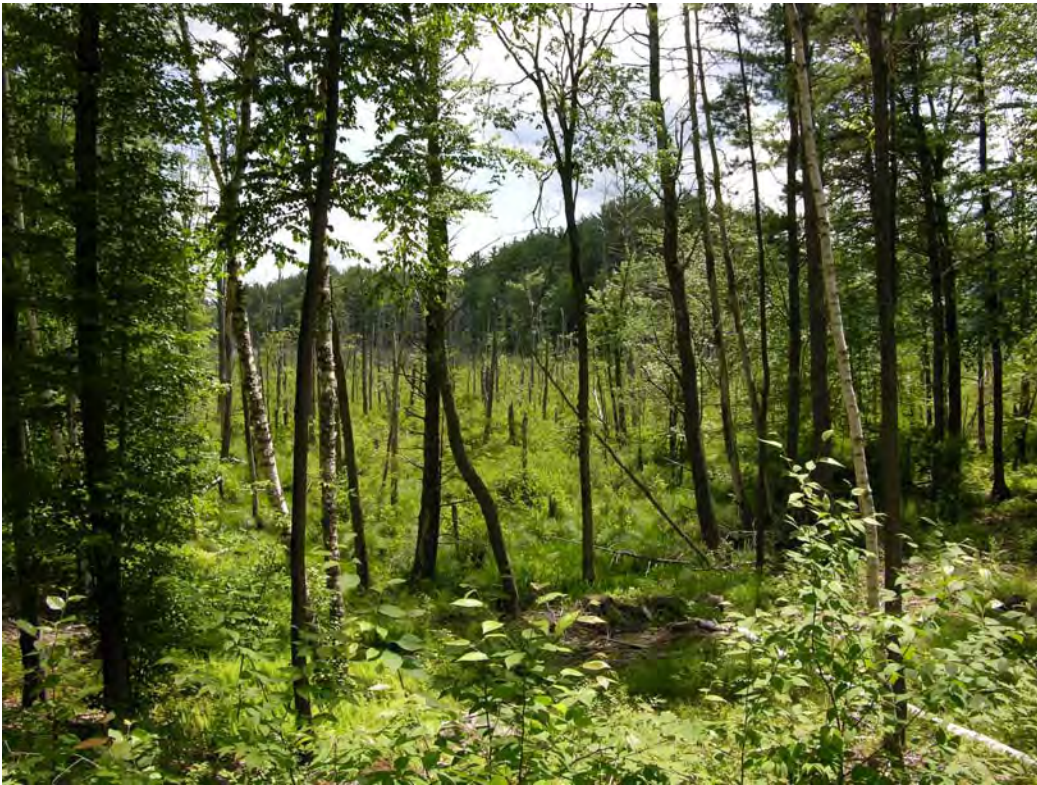
1. This is a view of the northern end of Wetland #8 looking south.