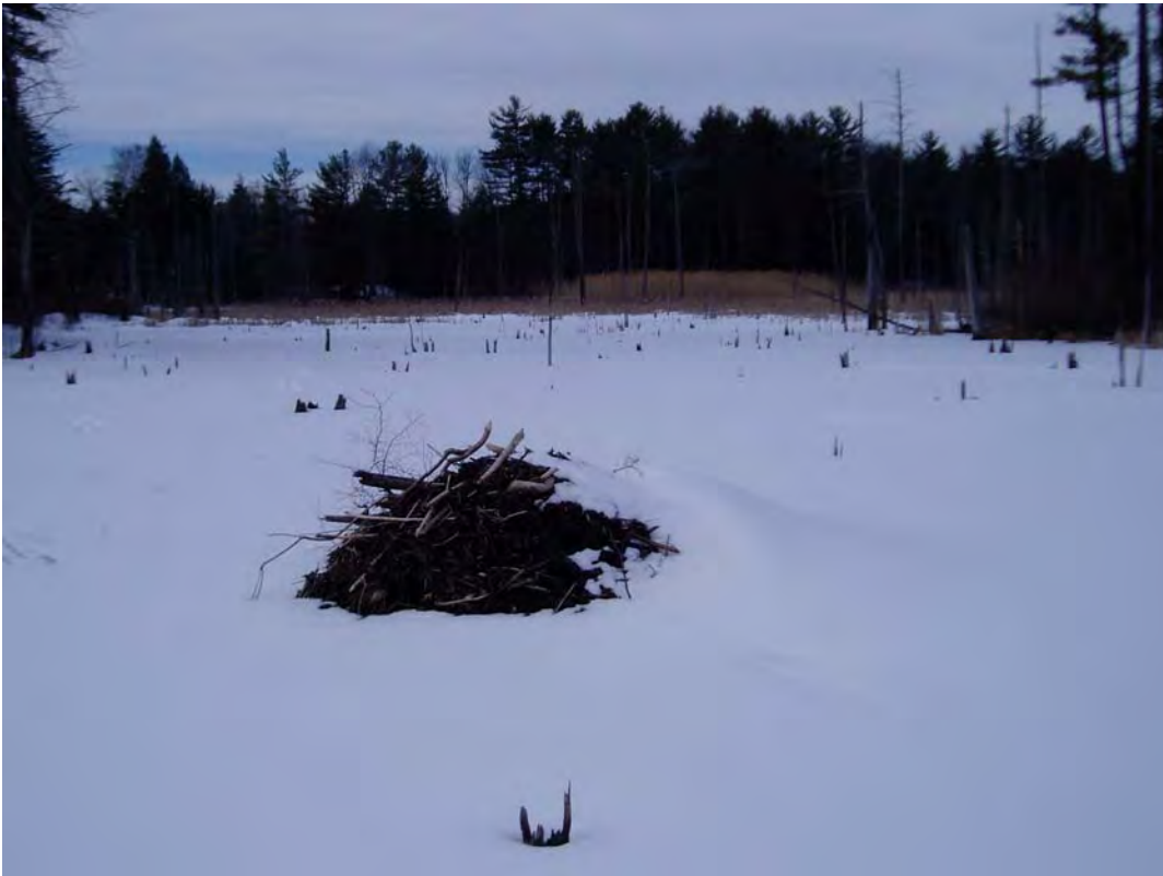
3. This photo shows another beaver lodge situated in the southeast section of Wetland #28.