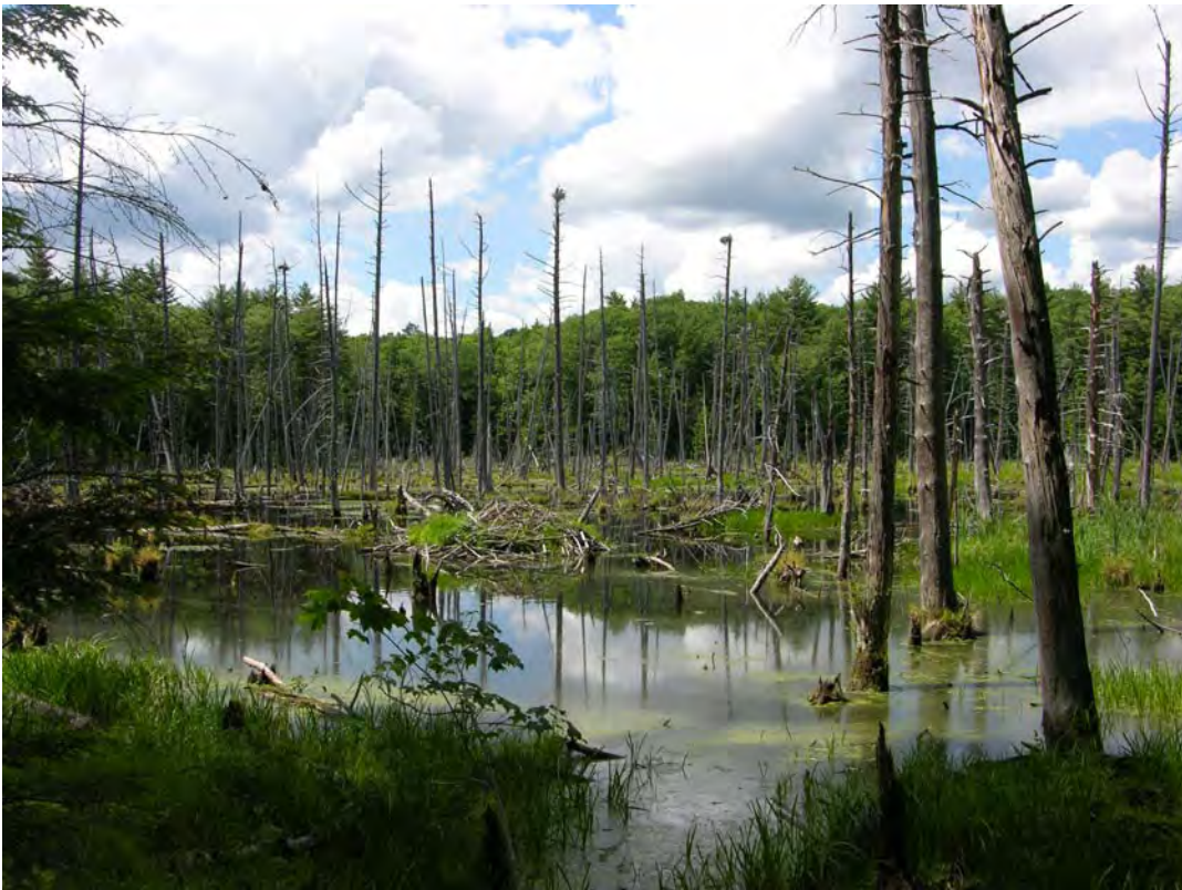
1. This isolated beaver pond includes 14 great blue heron nests and an active beaver lodge.