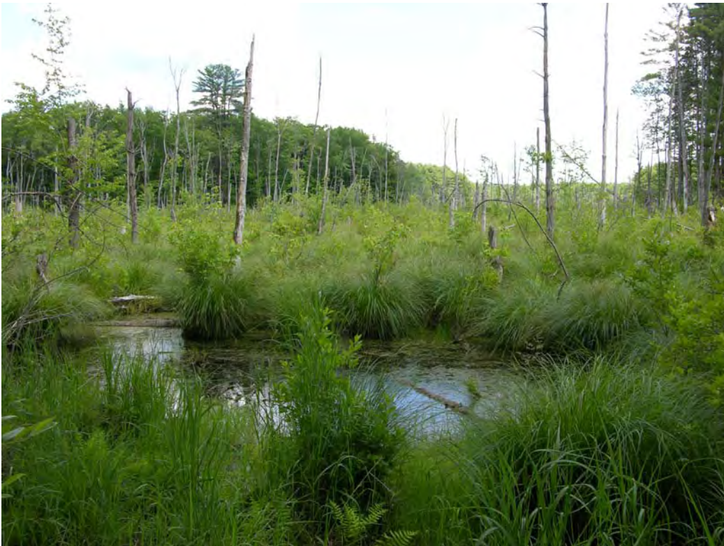
2. The central portion of this wetland includes shallow marsh and scrub-shrub habitat with numerous standing dead trees.