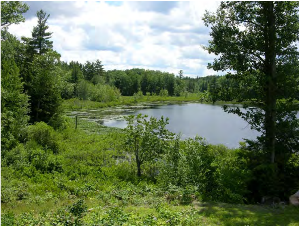
3. This is a view of Little Cub Pond looking southwest. Wetland #7 borders three sides of the pond.