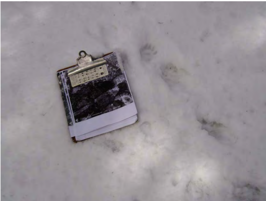
4. Fisher tracks (shown right of clipboard) were observed in the adjacent uplands.