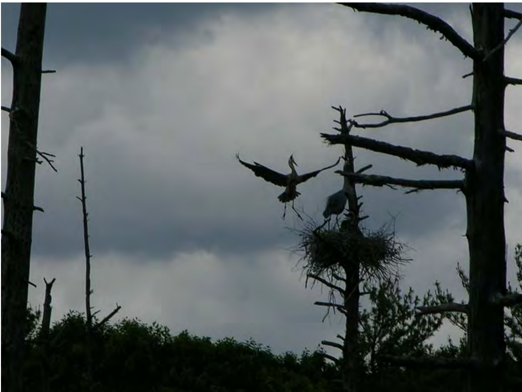
2. This is a view of a great blue heron adult returning to the nest to feed its young.