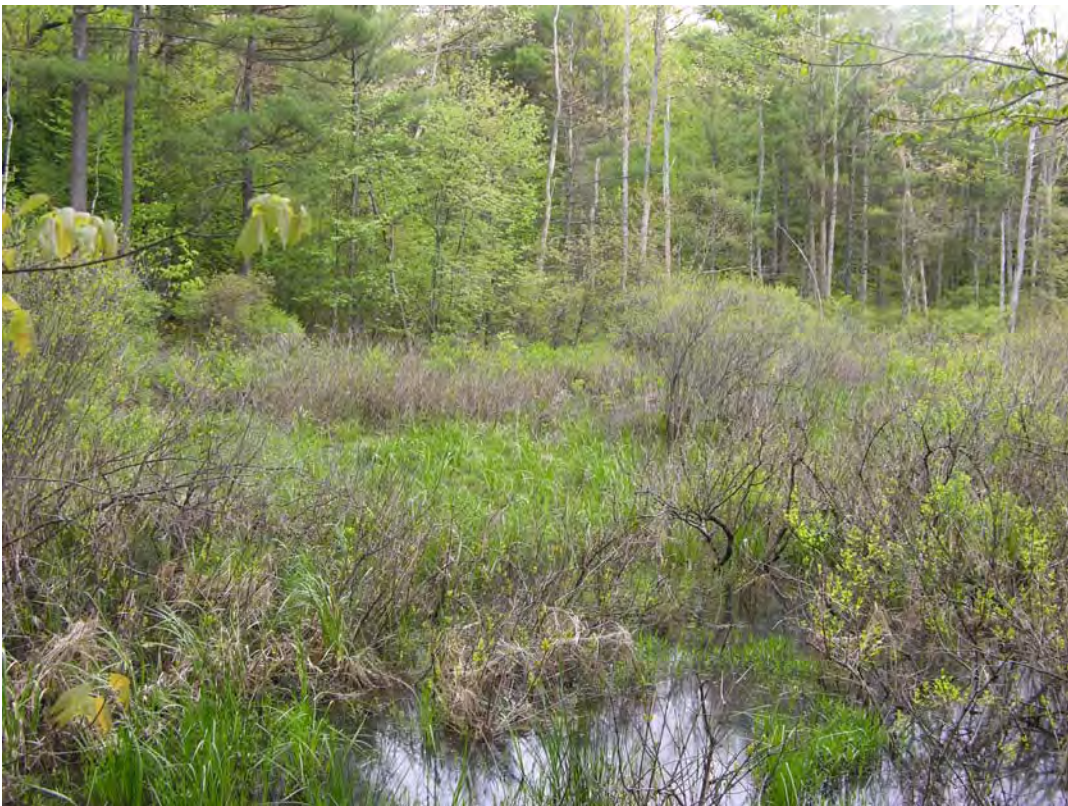
4. This is a view of the northern portion of the wetland which includes a scrub-shrub marsh.