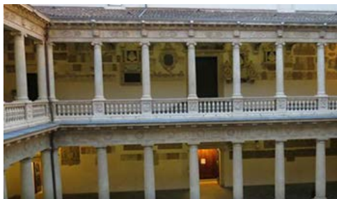
Patio at the University of Padova