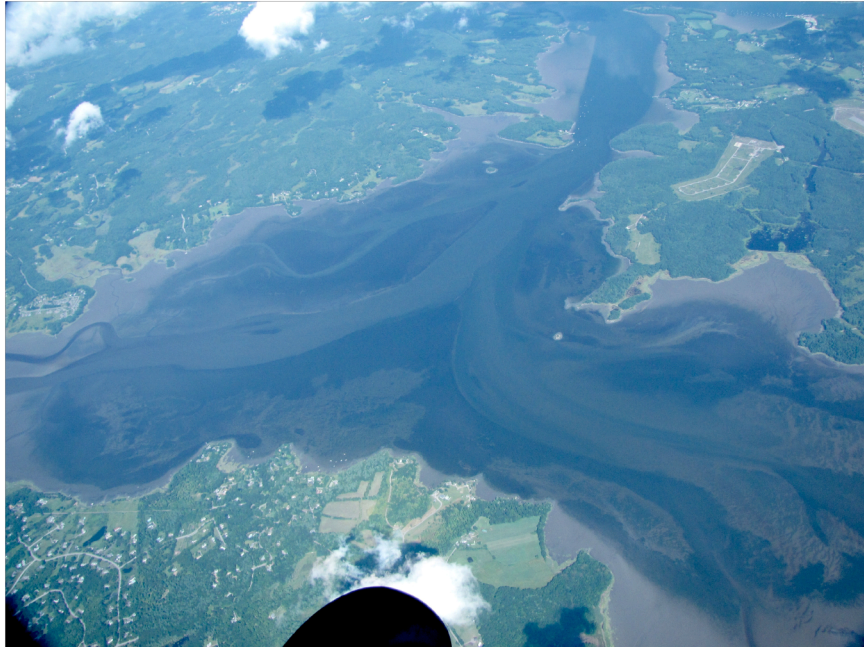
Figure 3. Aerial photo of Great Bay from 8000 feet, showing the dark pattern of eelgrass beds throughout the Bay, 23 August 2009.