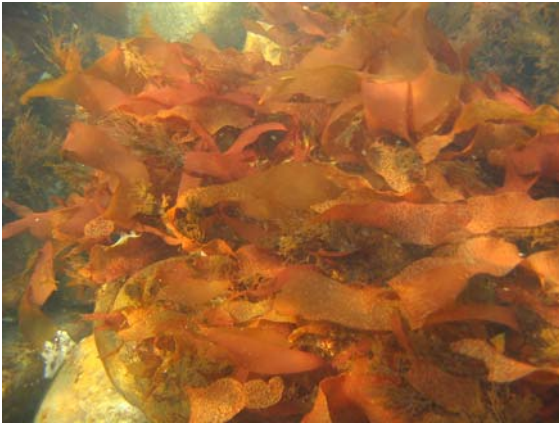
Fig. 2 A population of Grateloupia turuturu at Waterford, Connecticut, growing near the native red seaweed Chondrus crispus

nutrient-enriched water, it grows well in 22–37 ppt, and it can survive 12–52 ppt and 4–28°C (Simon et al. 1999, 2001). The plant's broad physiological tolerances suggest that it will be able to expand into the northerly parts of the Gulf of Maine and possibly the Bay of Fundy.