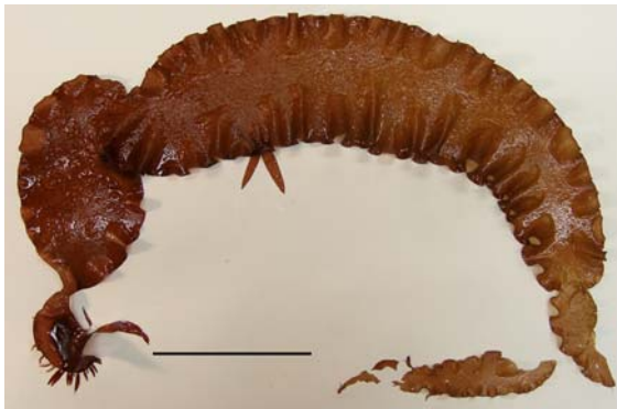
Fig. 1 A large blade of Grateloupia turuturu from Waterford, Connecticut with marginal proliferations (bar = 10 cm)

The Cape Cod Canal opened in 1914. Twelve kilometers in length, it is part of the Atlantic Intracoastal Waterway, connecting Buzzards Bay to the south and west with Cape Cod Bay to the north and east. The role of canals in facilitating movement