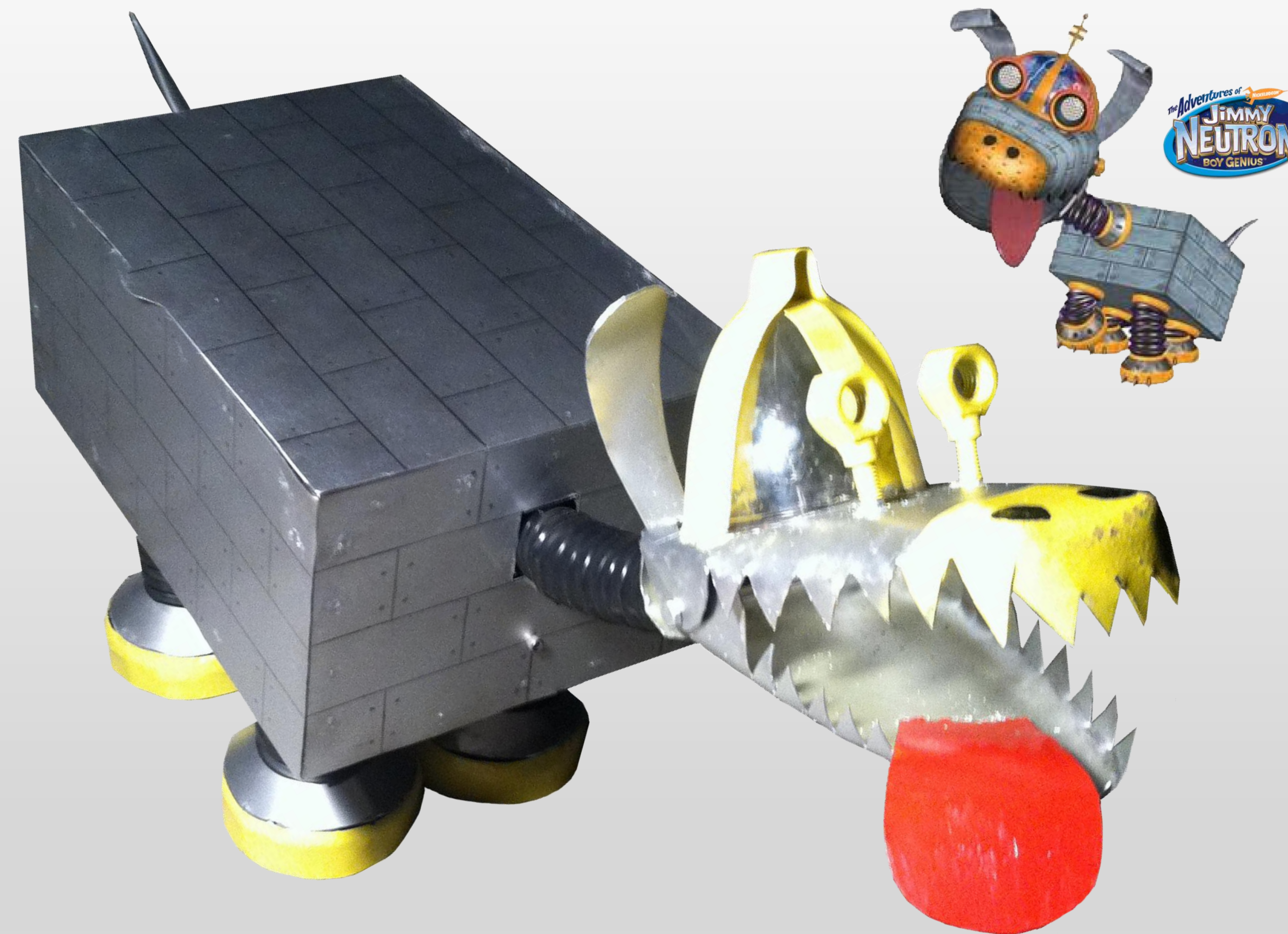
Comparison of real-life Goddard built by the Goddard Project team (left) with cartoon Goddard from The Adventures of Jimmy Neutron Boy Genius (top right).

The mission of The Goddard Project was to research, design, and experiment with electronics, mechanics, software design and artificial intelligence to produce a clever, fun, and loveable companion.