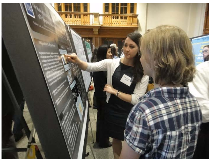
Author (left) explaining her project at the Undergraduate Research Conference in Durham, April 2012.