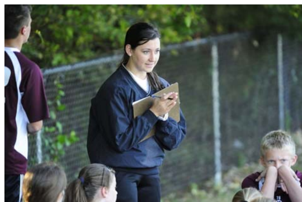
Author as Athletic Director coaching high school soccer players.