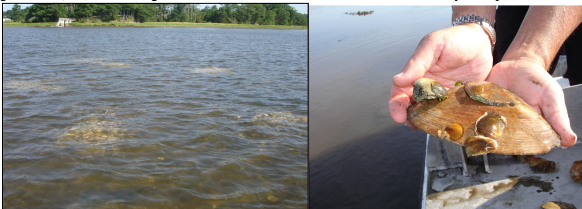
Figure 12a (left) shows high-relief shell areas at low tide; 12b is natural oyster spat on clamshell

Natural spat recruitment on clamshell was assessed using a stratified sampling method. We observed that shell distribution across the reef was more uneven than in previous years, likely due to a change in the size of the feed bag chute. Three categories of shell depth were stratified: high-relief (about 3-4" of shell), low-relief (~1" of shell), and no cover at all. Figure 11 shows sampling from high-relief areas. We did several drifts over the reefs on a minus-tide to estimate the relative amount of each cover category. Coverage of reef area was estimated as 20% high-relief, 40% low-relief, and 40% with no shell cover. We obtained 7 random quadrat samples in high-relief and 13 in low-relief areas for a total of 20 samples. See Figure 12a for an image of other high-relief areas in one section of reef at low tide. Sample results showed that high-relief areas were especially successful at settling spat, with an average of 89/m^2 . Low-relief areas were much less dense at 4.5/m^2 . From our cover percentages, we estimate a total natural recruitment of 58,180 spat and an overall density of 19.5/m^2 across the two-acre grids. This result met our restoration objective to recruit 20 spat/ m^2 from natural sources. Figure 12b shows examples of oyster spat settled on clamshell.