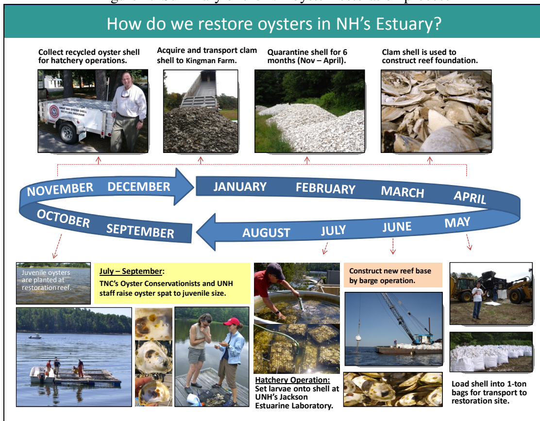
Figure 2. Summary of the NH oyster restoration process

Lessons learned from the pilot reef led us directly to an expansion of the UNH hatchery operation. We quickly recognized that natural recruitment, even supplemented with volunteer-raised spat, was not adequate to rebuild oyster reefs at a pace that achieved estuary-scale improvements. Seed supplements were clearly needed to achieve oyster densities of about 50/m 2