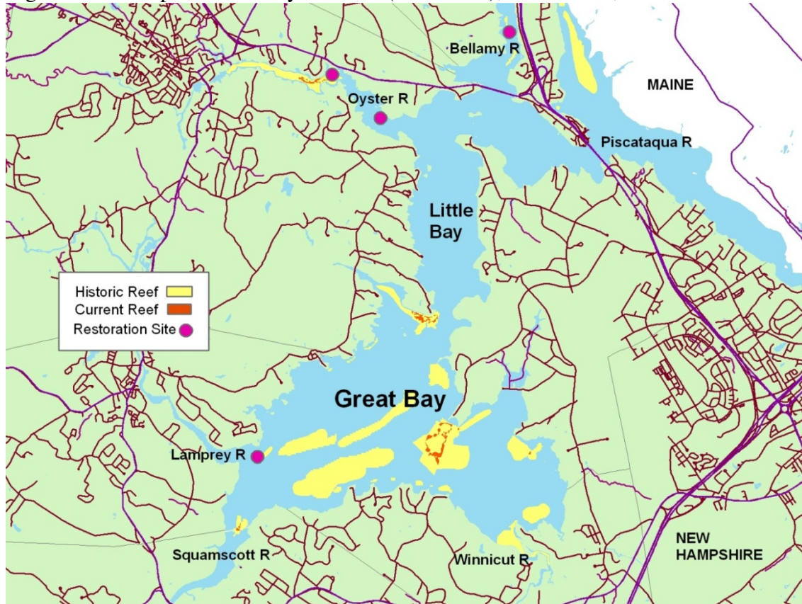
Figure 1. NH map of historic oyster reefs (circa 1970), current reef, and restoration sites

In 2009, TNC and UNH developed methods to restore oyster reefs by “planting” shell on silted channel bottom, using primarily surf clam shell ( Spisula solidissima ) acquired in bulk from a seafood processor. That June, we constructed a 0.203 acre (8,100 ft 2 or 752 m 2 ) shell reef with