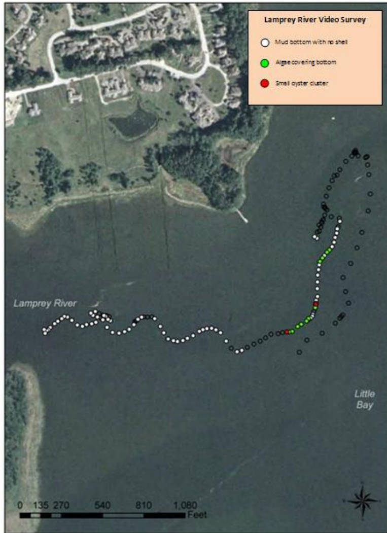
Figure 6. Video monitoring at Lamprey River

Reef Construction Results (Task 3). In May and early June, TNC, UNH staff, and volunteers worked together to stage the shell for the reef construction, was loaded into one-ton weave feed bags for transport. We used a salt-and-sand spreader from UNH with a reversible conveyor belt, in combination with a front-end loader and a tractor forklift, to load the 200 bags (Figure 7). In early June, the bags were loaded onto flat-bed trailers and transported to the Pickering and Riverside Marine dock in Eliot Maine.