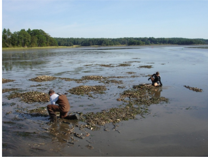
Figure 11. Quadrat sampling at Lamprey River Reef in September 2011

Natural spat recruitment on clamshell was assessed using a stratified sampling method. We observed that shell distribution across the reef was more uneven than in previous years, likely due to a change in the size of the feed bag chute. Three categories of shell depth were stratified: high-relief (about 3-4" of shell), low-relief (~1" of shell), and no cover at all. Figure 11 shows sampling from high-relief areas. We did several drifts over the reefs on a minus-tide to estimate the relative amount of each cover category. Coverage of reef area was estimated as 20% high-relief, 40% low-relief, and 40% with no shell cover. We obtained 7 random quadrat samples in high-relief and 13 in low-relief areas for a total of 20 samples. See Figure 12a for an image of other high-relief areas in one section of reef at low tide. Sample results showed that high-relief areas were especially successful at settling spat, with an average of 89/m^2 . Low-relief areas were much less dense at 4.5/m^2 . From our cover percentages, we estimate a total natural recruitment of 58,180 spat and an overall density of 19.5/m^2 across the two-acre grids. This result met our restoration objective to recruit 20 spat/ m^2 from natural sources. Figure 12b shows examples of oyster spat settled on clamshell.