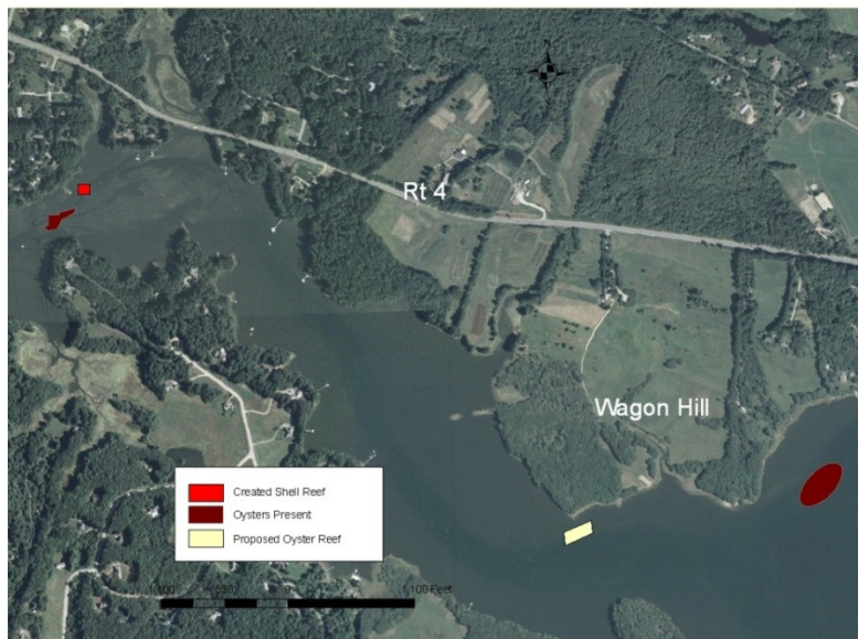
Figure 3. Oyster River (Durham) showing created pilot reef (red) and Wagon Hill reef (yellow)

In summer 2010, UNH’s Jackson Estuarine Laboratory (JEL) hatchery acquired 3 million disease-resistant oyster larvae from Muscongus Bay Aquaculture in Maine. Larvae were released in two large seawater tanks filled with cages of clean, recycled oyster shells. After “remote setting” to settle larvae on the shells, the cages were moved offshore to a JEL nursery raft for growing during the summer months. Fall sampling showed that an estimated 200,970