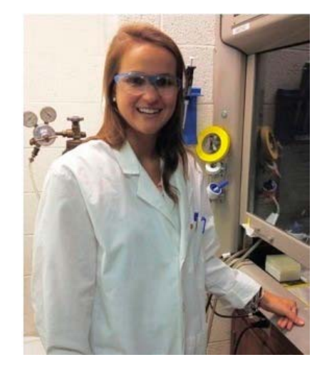
The author in the Kendall 407 laboratory where all the extractions took place.

Results showed that blood concentrations of lutein, zeaxanthin, \beta -cryptoxanthin, \beta -carotene, and Vitamin E significantly changed over time from the baseline at both dairies. However, statistics showed that the fluctuation pattern exhibited by each dairy was significantly different. Overall, the nine Jersey cows from the organic dairy had higher concentrations of blood lutein, zeaxanthin, a-carotene, and \beta -carotene than the nine Jersey