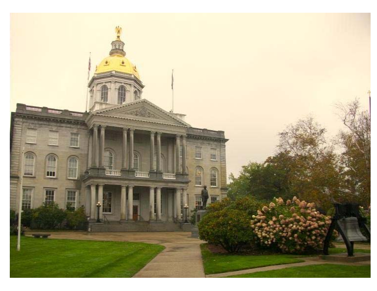
The New Hampshire State House on a cloudy summer afternoon. The legislative and executive branches of government meet here, but the judicial branch has its own building on the other side of

was fading and if New Hampshire was destined to return to the era of court-clearing—of a Supreme Court embroiled in the realm of politics. I stepped outside of the law school into a dreary, drizzly Concord. The sun, invisible behind the thick gray clouds, was setting. Carefully sidestepping the deep puddles that checkered the sidewalks, I began my walk back to the car, and it was not long before I reached the State House lawn. Since I first set foot on that lawn during a fourth-grade field trip, the edifice has always seemed to command me to stop for a moment and stare, perhaps out of respect for its simple grandeur or for the history that has been made within its walls. As always, my feet obeyed. The golden dome forced my eyes upward, but I soon tore them away to look across the street at the State Library. I smiled at the irony of the Supreme Court moving back into the shadow of the State House to escape the shadow of court-clearing, that old specter that has chased it down through the centuries. Although I cannot guess what the future has in store for the New Hampshire Supreme Court, my summer research has convinced me that the events of the nineteenth century are as important